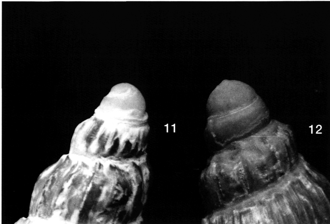
Fig. 11. Fulgoraria isabelae n. sp. Paratype 3. Fig. 12. Fulgoraria (Saotomea) delicata (Fulton, 1940).