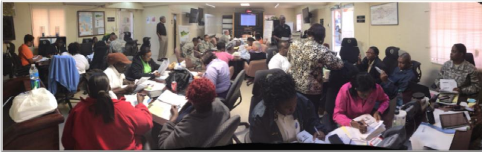
Tsunami Awareness Course-AWR-217

All of efforts have in collaboration with a number of local and federal partners including; the National Tsunami Warning Center, Puerto Rico Seismic Network, Caribbean Tsunami Warning Program, the Virgin Islands National Guard, National Disaster Preparedness Training Center (supported by US Department of Homeland Security-FEMA), USVI government departments, U.S. Coast Guard, University of the Virgin Islands and Caribbean Coastal Observing System.