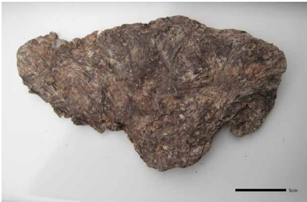
Fig. 4: Ploughed up plaques of eelgrass from the area of the Paludanus' road.

Secondly, the burning of eelgrass may have served as a method to produce fertilizer. In Normandy washed up sea vegetation (called warec ) used to be collected and applied either burned or fresh as a fertilizer rich in potash and other minerals (Van Ravelingen 1644, 780-782). Eelgrass would in this respect be inferior to true algae ( Laminaria spp., Fucus spp., Ascophyllum spp.), which contain more potash. Yet there is evidence that coastal communities used eelgrass as fertilizer if there was no alternative, although there is no specific record of burning it (Wyllie-Echeverria & Cox 1999; Alm 2003).