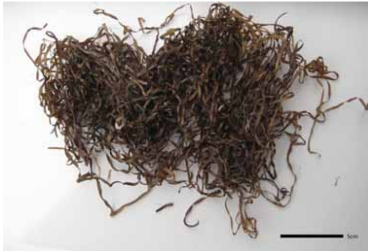
Fig. 1a: Dried common eelgrass (Zostera marina).