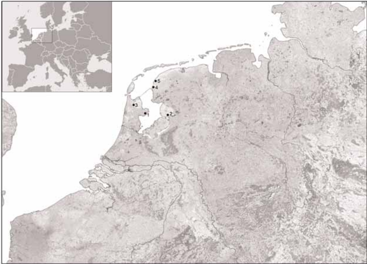
Fig. 3: Location of discussed sites: 1 – Southern part of Westfriesche Omringsdijk; 2 – Schokland; 3 – Kolhorn, Paludanus'road; 4 – Kimsward, Zürich; 5 – Wijnaldum.