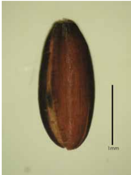
Fig. 2: Picture of dwarf eelgrass ( Zostera noltii ) fruit.