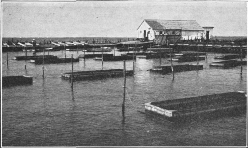
A Crab Pound—Crab floats are tied to stakes in the sheltering pound. When algae-covered or partially water-logged they are removed to dry, as may be observed in front of the shanty.

The soft-crab industry is centered largely at Crisfield, Maryland, within forty miles distance from which point the main shedding grounds for legal size crabs are located. Peeler crabs are captured most typically by means of sailboat-drawn scrapes, although a large portion of the entire supply comes from trotlines. A small part of the Crisfield supply is taken by means of dip nets. The term "run crabs," as used in the industry, covers those purchased at distant points and transported over long periods of time with consequent