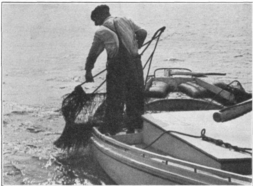
Hauling Crab Scrape Aboard—Crab scrapes are made of ridged frames with rope-constructed bunts. A flat bar at the bottom moves over the grassy surface and gathers peeler crabs.

The placing of green crabs on shedding floats has been shown to be the cause of a marked increase in the death rate of impounded crabs. Of the more mature crabs, late in the instar, confined on floats, the death rate would seem to be unnecessarily high in that among the crabs with colored rings the loss in the industry usually