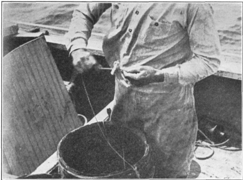
Baiting a Trotline—Trotlines are a half mile long. Salted eel and tripe are preferred types of bait used on local waters.

Data in Tables II and III indicate that scrape and netted crabs contain the smaller numbers of green crabs and, conversely, that