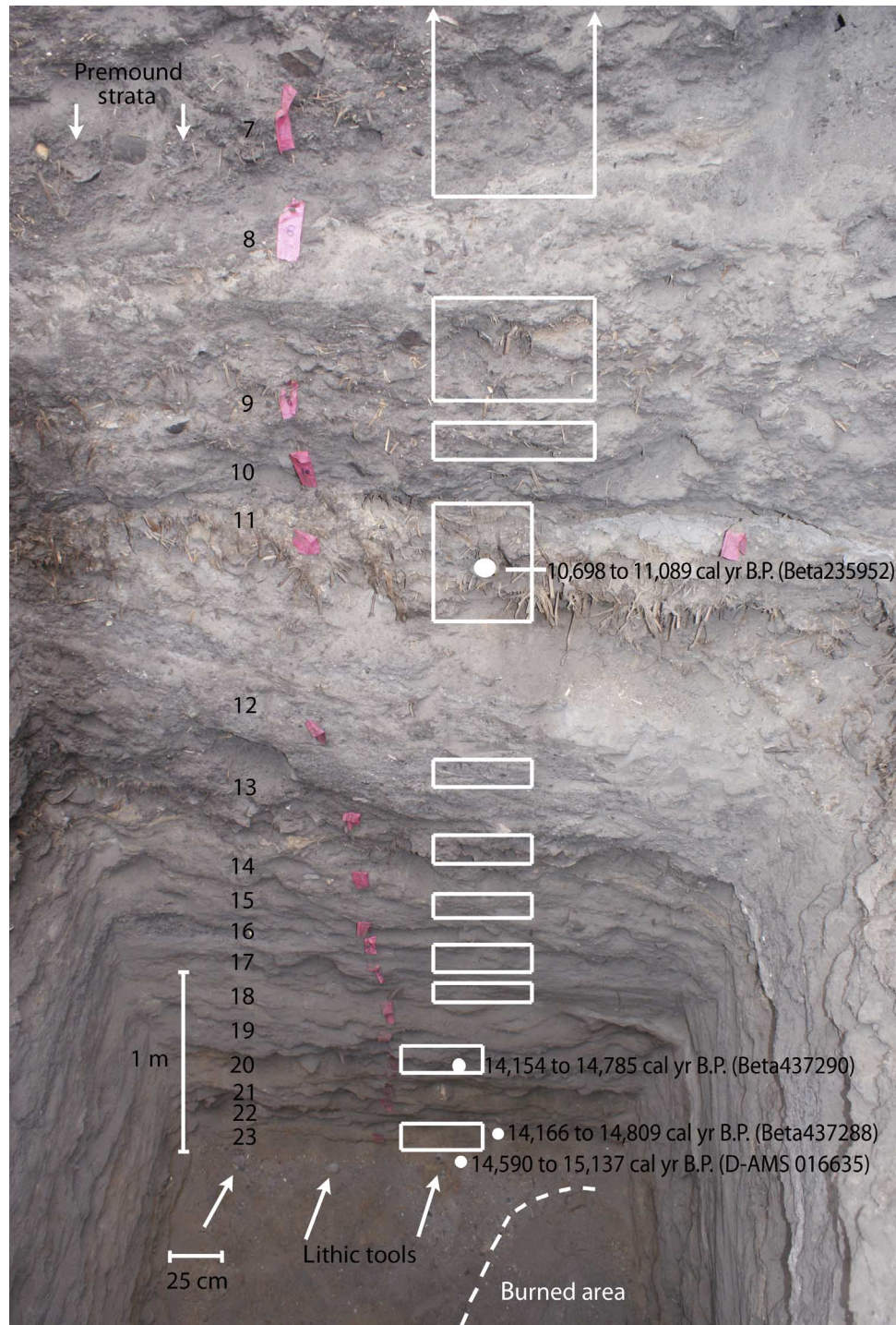
Fig. 3. Stratigraphic profile of Unit 12 showing early basal cultural deposits and radiocarbon dates.

It is likely that some of the conglomerated rock and sediment identified by Bird's work in the 1940s as culturally sterile on the north end of the mound at Huaca Prieta, where his primary excavations were located (15),