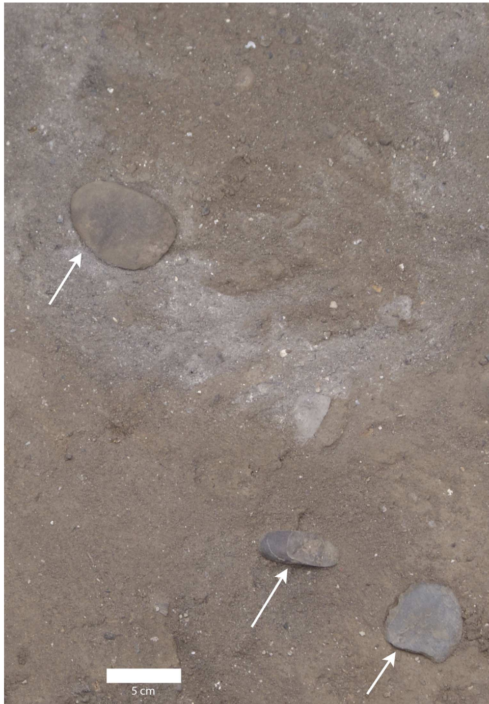
Fig. 4. Burned and other cultural features and unifacial basalt flakes in Layer 20, Unit 12.

Several lines of evidence consistently suggest that most of the recovered faunal remains were gathered primarily at nearshore and in nearby back-barrier and vernal pool wetlands, located several kilometers to the west of the terrace sites during the Late Pleistocene (fig. S10 and sections