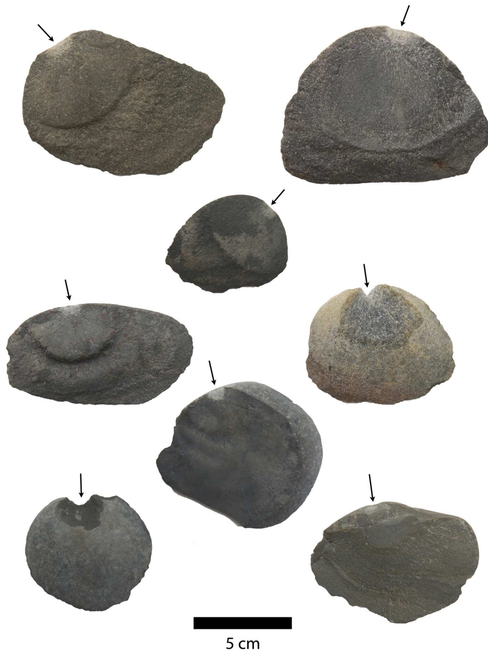
Fig. 5. Unifacial basalt flakes most representative of 15,000 to 13,500 cal yr B.P. deposits showing marked platforms and bulbs of percussion (arrows).

It should be noted that we have examined more than 1 million lithic tools and debris from our excavations and surface collections along the Chicama coast and from Bird's artifact collections from there, and we have not yet documented a single bifacial implement. It is our opinion that the early cultural periods under discussion for this section of the north coast of Peru were exclusively characterized by unifacial lithic