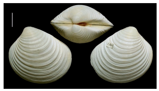
Figure 1. Clementia papyracea (Gmelin, 1791) from Palaiochora (Kriti, Greece). Scale bar: 1 cm.

Bivalve species with a medium-sized shell (maximum length ~70 mm), thin, inflated, equivalve, inequilateral,