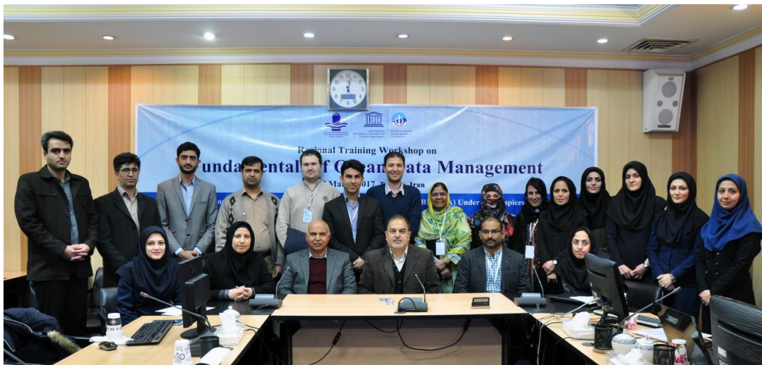
Closing of the Regional Workshop on “Fundamentals of Ocean Data Management

Please see the detailed report of the workshop in the Attachment 2.