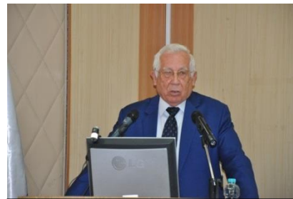
Dr. Iouri Oliounine, Representative of UNESCO/IOC

In their speeches they all stressed importance of establishing the first UNESCO Category 2 Center dealing with marine related issues not only in the region but in the world. They all expressed a strong belief that the work of the Centre will facilitate cooperation between the Member States of the region and between different national institutions involved in the ocean and coastal area research, protection and management.