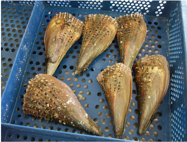
Figure 1. Atrina maura procured from the bottom culture at San Buto estuary in Baja California Sur, México [20].