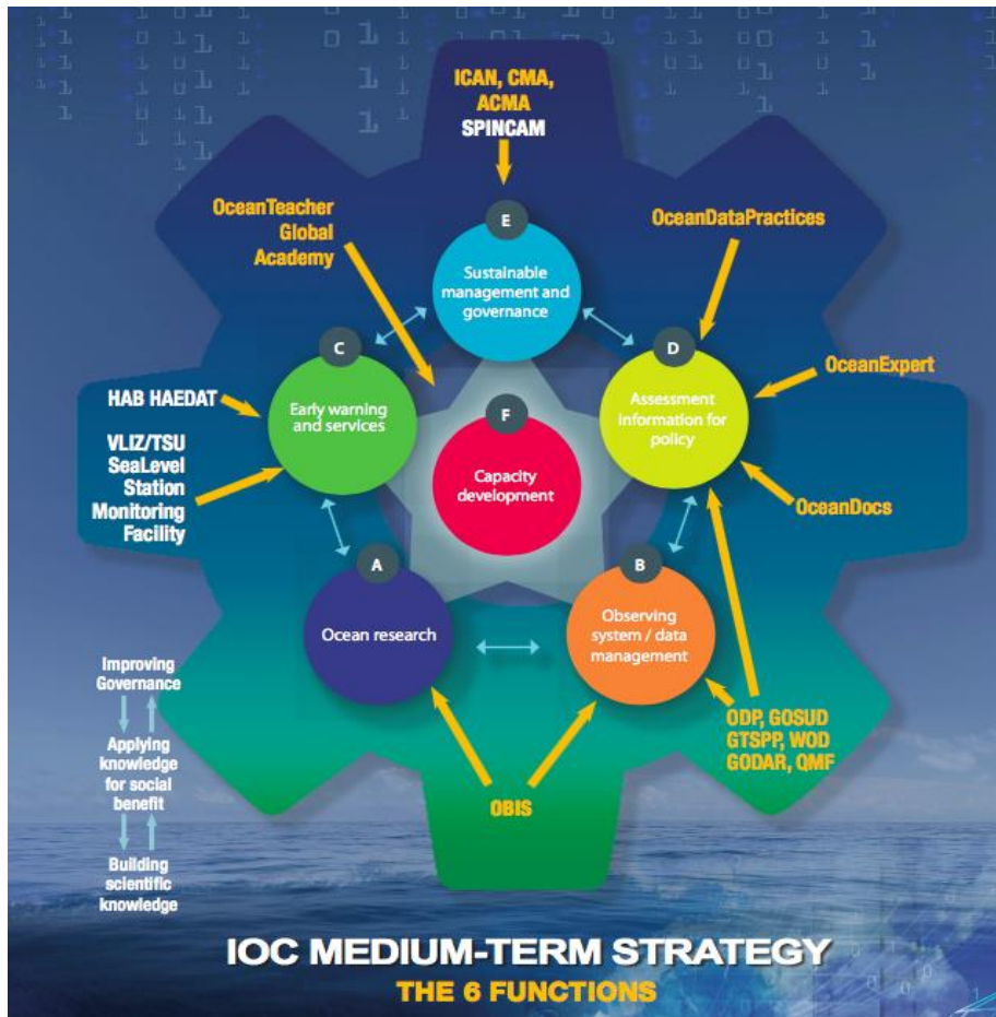
Figure 1. The role of data and information management to the IOC Medium-Term Strategy

Data and information management is a crucial cross cutting and underpinning activity across a broad range of the environmental sciences. Mutual benefit is gained from cooperation and interaction across IOC programmes to ensure HLOs are met. Harmonization of this Strategy with other UN organizations and other non-IOC projects and activities is essential.