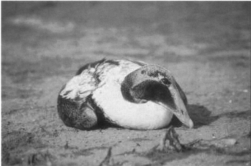
Dying Common Eider at Griend, June 1999 Stervende Eider op Griend, juni 1999 (R. Oosterhuis)

Although our data are based on a small number of nests (albeit a large proportion of the local breeding population), there have been no detailed studies of breeding success elsewhere in the Wadden Sea following the major mortality in 1999/2000. A combination of all our results shows that the reproductive output of Common Eiders at Griend in 2000 was much lower than in previous years.