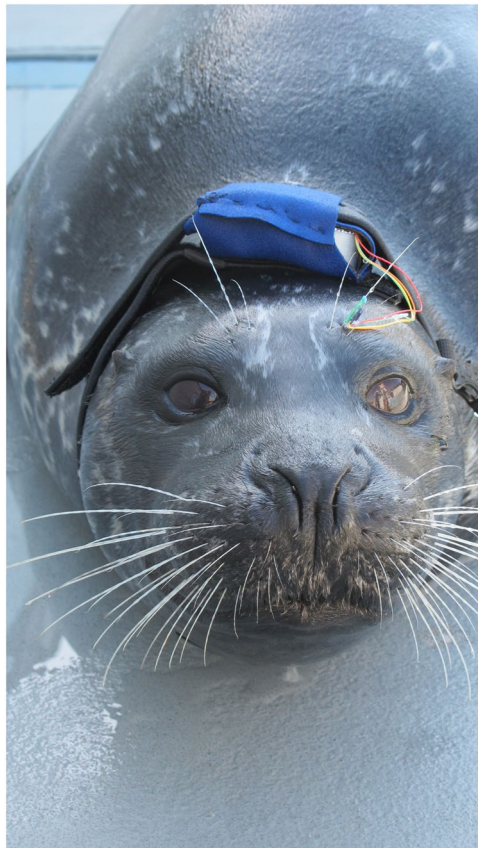
Figure 1. The accelerometer tag worn by a trained harbor seal. Photograph of the seal wearing the tag during live animal testing. The digital accelerometer is attached to a supraorbital whisker and connected by small wires to the datalogger, which is fitted to the animal's head inside a pocket of the neoprene headband.

Excised whisker testing in the flume tank utilized laser vibrometry and revealed distinct changes in vibration when the whisker encountered a hydrodynamic disturbance (Fig. 2). In free-flow , the whisker vibrated in a narrow frequency range. When a hydrodynamic disturbance from a cylinder with a shedding frequency of 4.2 Hz was placed upstream ( disturbance condition), the vibrational signal spanned a broader range of frequencies. The difference between conditions can be quantified by comparing the Q value, a dimensionless parameter describing the bandwidth of a signal relative to its center frequency ( Q_{free-flow} mean = 4.7, sd = 1.4; Q_{disturbance} mean = 1.4, sd = 0.5; p < 0.001 ). While the addition of a hydrodynamic disturbance caused the vibrations on the whisker to markedly shift from a narrowband to a broadband signal, it did not significantly change the overall energy of the whisker signal ( p = 0.43 ).