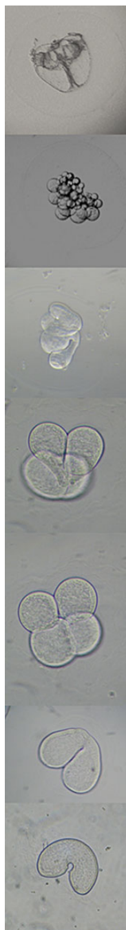
Fig. 2. Pictures of Mnemiopsis leidyi eggs ( 503 \pm 58 \mu\text{m} ) of different, early cleavage stages including one late developmental stage (the top image in the sequence) with a fully developed larvae ( 300 \mu\text{m} ) inside the egg shell. Egg sizes have a similar size range in native and invaded, northern European populations ranging between 440 and 625 and 480 and 630 \mu\text{m} diameter, respectively.

northern Europe for largest sized animals is around 7\text{--}10\% \text{day}^{-1} of the body carbon. This is four times higher than previously documented, due to the underestimation of