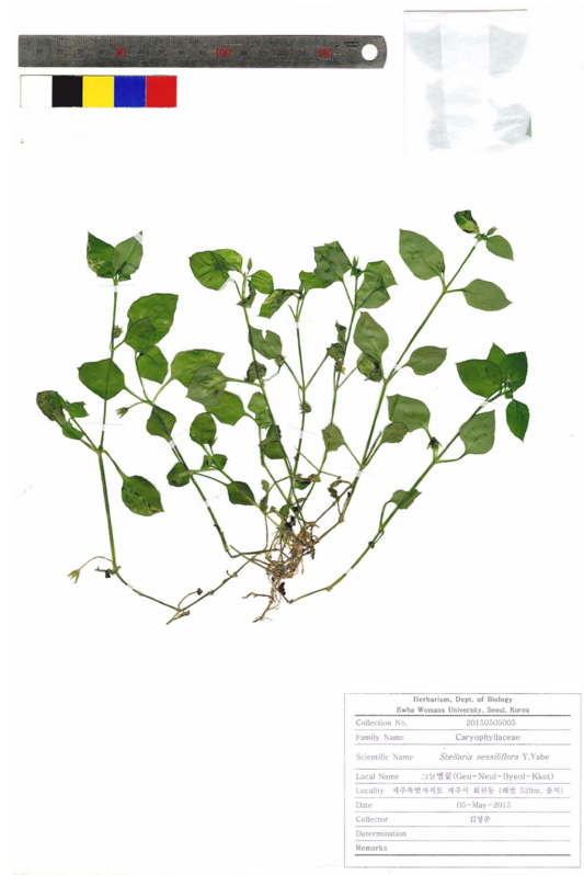
Fig. 3. Voucher specimen of Stellaria sessiliflora Y. Yabe in EWH.