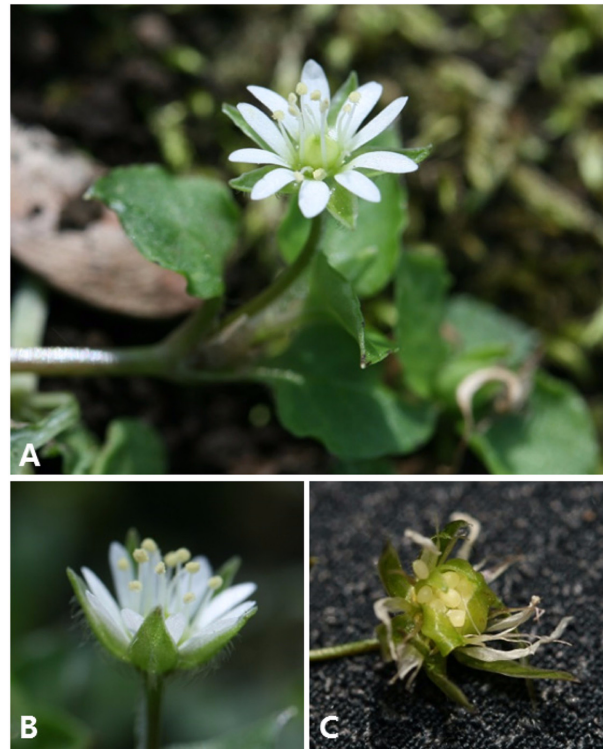
Fig. 4. Photographs of Stellaria sessiliflora Y. Yabe taken by M.J. Kim in Jeju Island on 23 April 2012. A. Flower and Leaves; B. Lateral view of flower; C. Capsule.