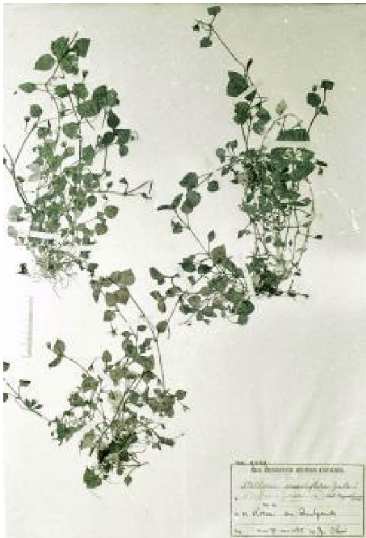
Fig. 2. Photograph of specimen (Slide No. 6294) of Stellaria sessiliflora Y. Yabe (Lee, 2012).