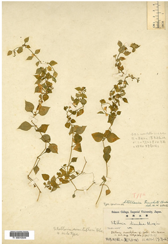
Fig. 1. Type specimen of Stellaria sessiliflora Y. Yabe in T.I.