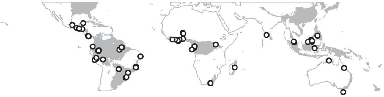
Figure 1. Sites with data used in the models of species occurrence and abundance (circles). Grey shaded areas are those defined as being tropical or sub-tropical forest according to the BIOME model [24].

to land-use and other environmental gradients may be mediated by the functional traits of species: large, slower-breeding, less-mobile species that are dietary and habitat specialists are typically more vulnerable to land-use change than other species [7–13]. The traits that confer vulnerability to land-use change vary geographically [14,15], with tropical forests containing a high proportion of species having traits likely to render them vulnerable to land-use change [13,16]. Tropical forests are predicted to experience among the greatest rates of natural vegetation loss in the near future [17].