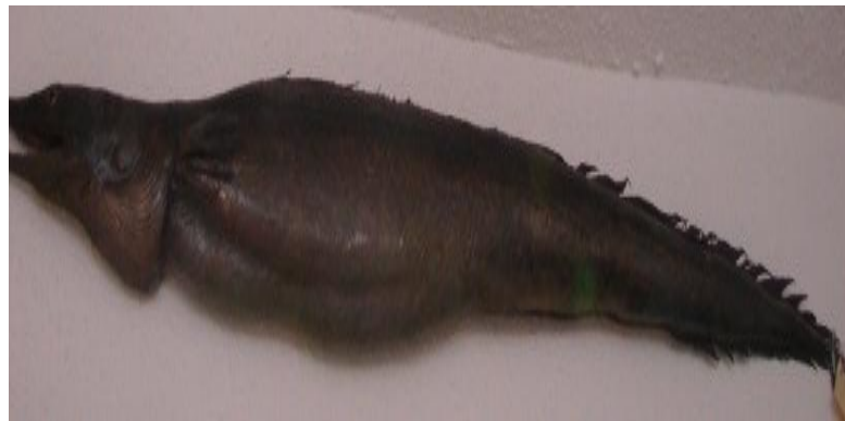
Figure 5: Synphobranchius affinis Ref. code: K, (Owfi and Abbasi, 2007)

Collected from Kish Island in coralline rocky habitats (Persian Gulf) and kept in Darabad Museum (Ref. code: K), without scientific and museum codes (Tables 1, 2; Fig. 5).