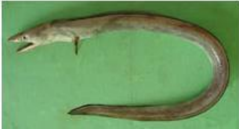
Figure3: Muraenesox Bagio Ref. code: E, (Owfi and Abbasi, 2007)

Muraenidae: Included 15 genera and 200 species, and 5 genera and 8 species identified from Muraeninae subfamily.