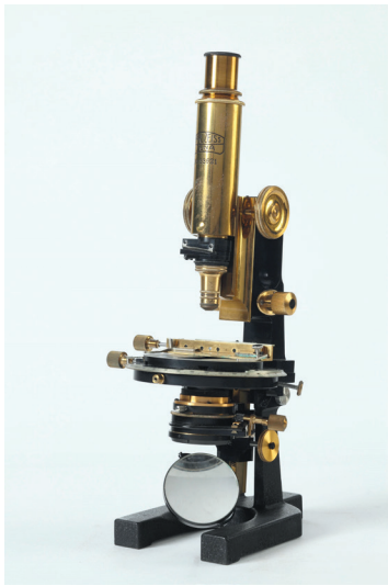
Fig. 3. Microscope: manufacturer C. Reichert, Vienna

Expert analysis began in January 2014. The collection was divided into several smaller sub-collections to simplify and streamline the work. This division was done based on the similarity of the items, belonging to basic science, and the number of items in the collection. This resulted in the creation of the following sub-collections: algological, anthropological, botanical, geographical and economic, geological and mineralogical, malacological, mycological, microbiological, zoological as well as the equipment sub-collection. There were 10 sub-collections, containing in all 1153 items.