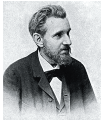
Fig. 2. Václav (Wenzel) Frič (after: REILING & SPUNAROVA, 2005)

Most of the items have an important methodological, pedagogical, professional, aesthetic and cultural value and therefore they were listed in the Register of Cultural Monuments of Croatia – List of Protected Cultural Monuments (OFFICIAL GAZETTE, 2011). The Decision on the status of the collection was issued on 20 February 2015 by the Board for the Protection of Cultural Heritage of the Croatian Ministry of Culture in Zagreb (ANONYMOUS, 2016).