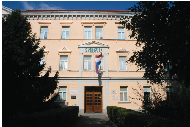
Fig. 1. Karlovac Gymnasium

In 1878 the Royal Grammar School in Karlovac became the High Royal Grammar School and, on the 1 st of August 1882, due to the increase in the number of students and the need for more space, Emperor Franz Joseph I signed the decree which merged the Realschule in Rakovac and the Royal Grammar School into one educational institution bearing the name High Royal Grammar Realschule in Rakovac (Fig. 1). This