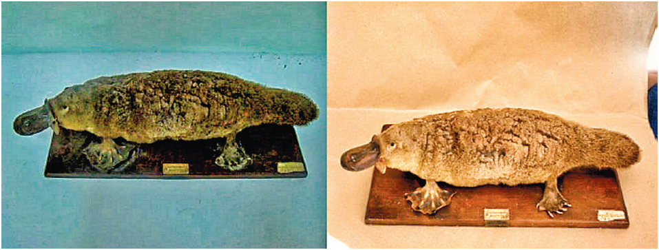
Fig. 4. Platypus before and after restoration (Inv. No. 693)