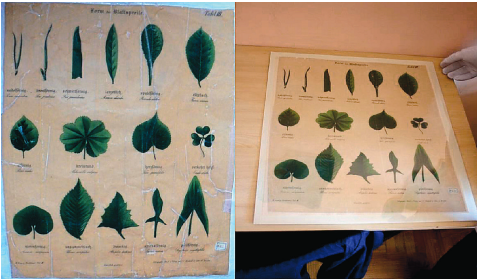
Fig. 5. Drawings of the morphology of simple leaves before and after restoration (Inv. No. 881)