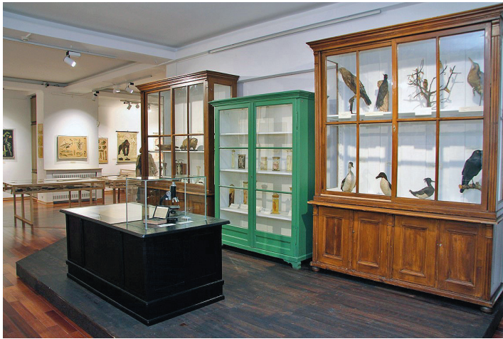
Fig. 8. Restored cabinets and part of the collection before the exhibition

the sensitive or damaged items in the collection, as well as rare and important objects, to the Museum as a temporary loan where they will be restored. The rest of the collection, which can survive in the current conditions, will remain in the school where it is planned to find an adequate place for the collection. In time this place will be adapted so that it can provide the best possible conditions for the collection and be used as a semi-open and/or closed storage area, allowing further professional and scientific work on the collection as well as welcoming groups of visitors. The ideas for such a space include devices which maintain constant temperature conditions (air-conditioning), humidity (dehumidifiers and humidifiers) and light (shutters on the windows and glass with UV protection) (VINTERHALTER, 1993). In addition, the collection needs