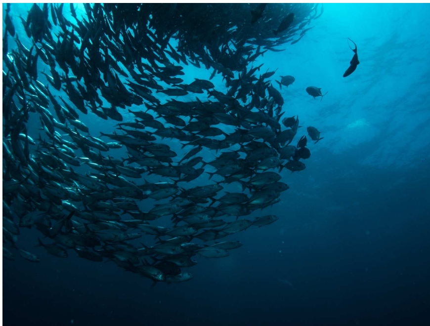
High-definition cameras are among the many tools giving researchers a new look underwater. Shown here is a school of black jack.

Scientists and engineers are intensifying their efforts to develop new technologies and to adapt existing ones for marine exploration. Artificial intelligence (AI) is being used to more