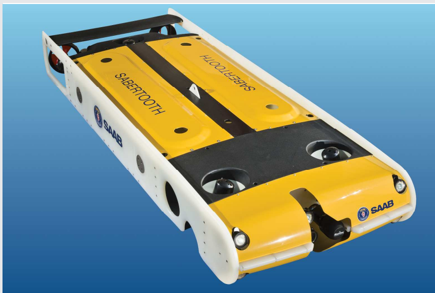
Saab's Sabertooth Double Hull.