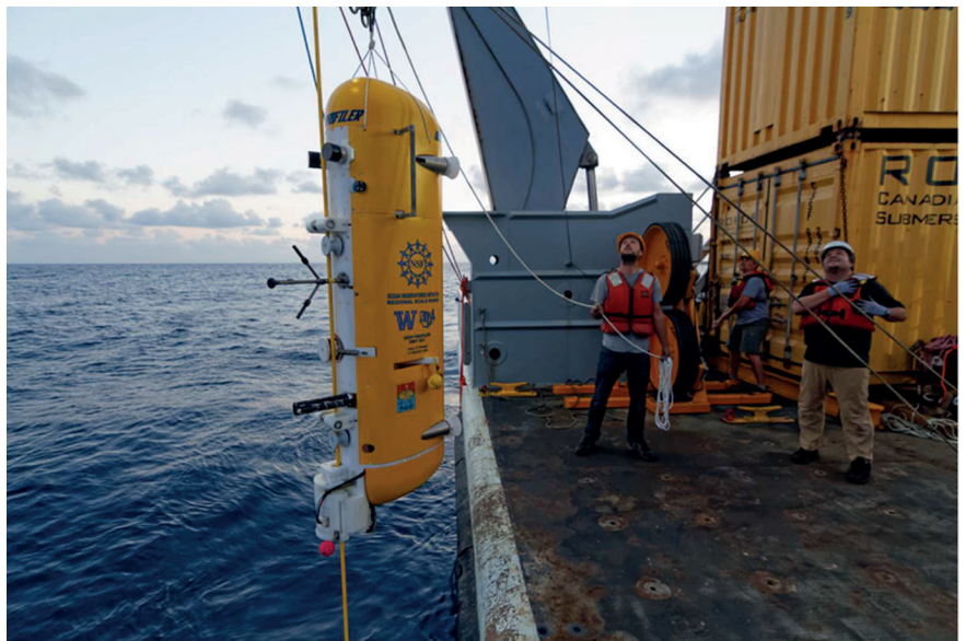
A deep profiling mooring deployed by the NSF-funded Oceans Observatories Initiative in 2014, from the research vessel Thomas G. Thompson.

algal blooms. Scientists are using the Environmental Sample Processor (“lab in a can”) to collect and analyze water samples on site. The tool, developed at the Monterey Bay Aquarium Research