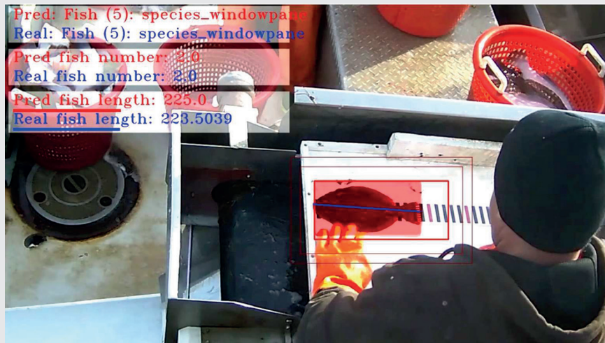
This shows a screen capture of the machine-learning algorithm at work, by a top finisher in the competition hosted by DrivenData ( http://drivendata.co ) with The Nature Conservancy. Red text are the algorithm outputs, and blue text are the true values.

The Nature Conservancy is using this electronic monitoring technology with the New England groundfish fishery. So far, 25 commercial fishing vessels—10 percent of the fleet—in New England have volunteered to test the new technology. Similar efforts are underway in the West Coast groundfish and Alaska longline fisheries, the Pacific tuna longline fishery, as well as operational programs in the United States, Australia, and Canada.