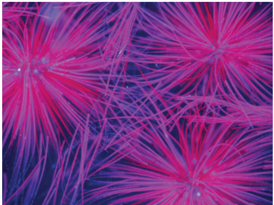
Researchers improve efforts to predict harmful algal blooms. Shown here are Gloeotrichia echinulata under an epifluorescent microscope.

Other tools are also helping researchers understand harmful