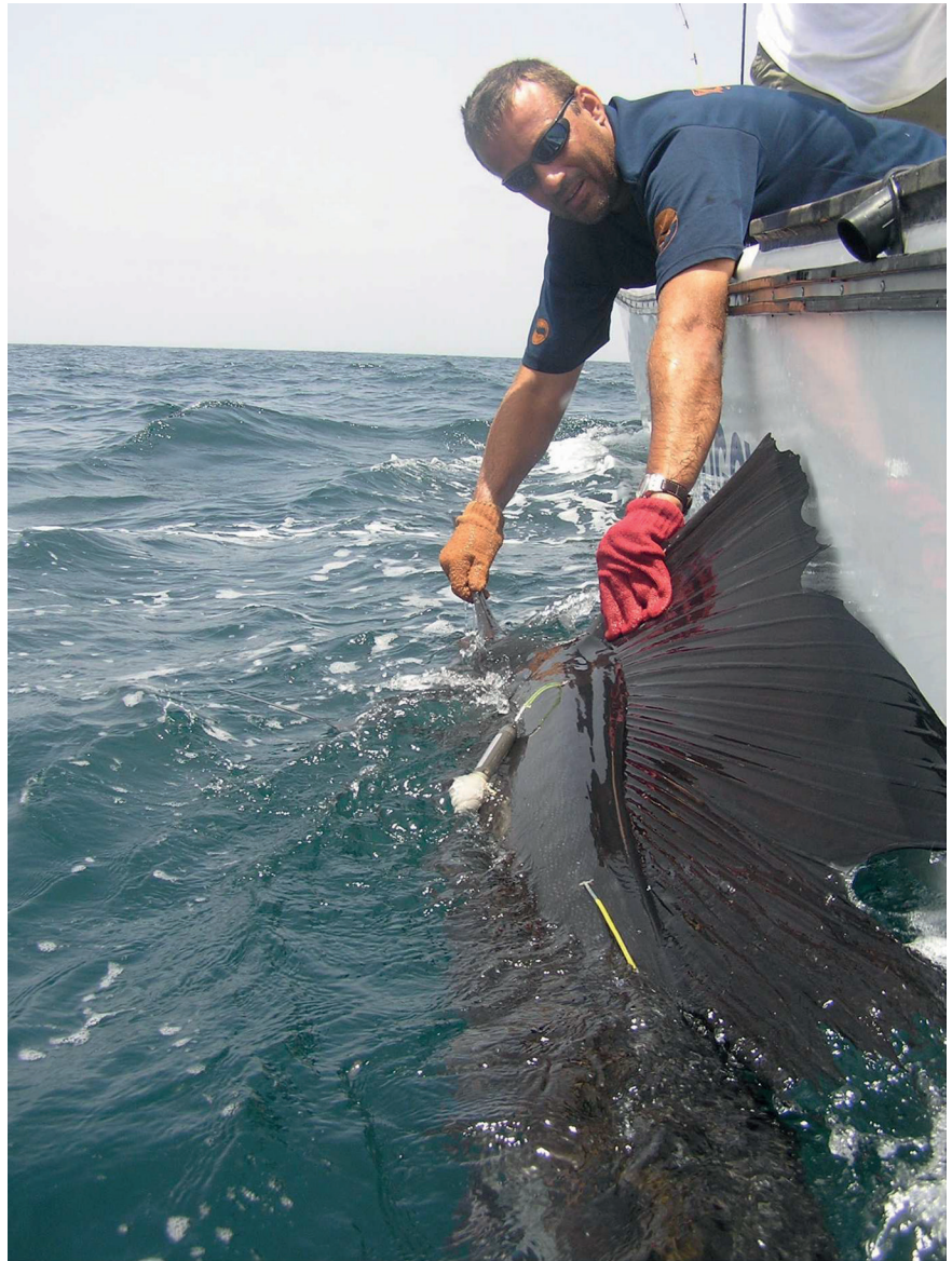
Billfish, sea turtles, and elephant seals are among the species used by researchers to explore the depths. Here, a large billfish is tagged with a tracking device.

The challenge becomes how to read all the data being collected. “I’ve been wearing out grad students, training them—which takes a while—to distinguish one species of snapper from another,” says Murawski. One promising solution is to employ AI, adapting facial recognition technology into “fish-al” recognition. “We’re working hard to perfect the system to give reliable products,” he says. “How many red snapper, how large, what are their habitats? If we can do this, we can revolutionize the whole process [of