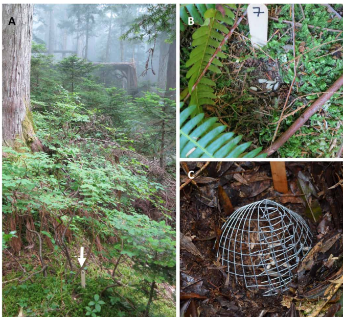
Fig. 1. Photos illustrating depot setup at field sites. Depots were not overly visible from >1 m away (A; arrow), as care was taken not to disturb litter and vegetation around depots (B). Invertebrate seed predation was assessed by excluding vertebrates from some sunflower seed depots using wire mesh cages (C). Photos are from 49°N in Canada at 880 meters above sea level (masl) (A) and 80 masl (B) and from 5°N in Colombia at 2120 masl (C).

Both categorical differences among biomes and continuous environmental gradients contributed to gradients in seed predation. Even after accounting for elevation and latitude, seeds above treeline experienced the lowest total predation (Fig. 2C) and invertebrate predation (Table 1, model 4). When we restricted our analyses to forests, the biome for which we have the best geographic coverage (72% of our sites; Fig. 2A), gradients in seed predation were shallower (Fig. 2, E and G), confirming that differences among biomes contribute to latitudinal and elevational patterns. However, significant latitudinal and elevational gradients existed within forests for both total and invertebrate seed predation (Fig. 2, E and G), with particularly strong effects of elevation at high latitudes (significant latitude × elevation interactions; Table 1, model 5). Persistent gradients in interaction intensity within forests demonstrate that lower alpine and tundra seed predation cannot fully explain latitudinal and