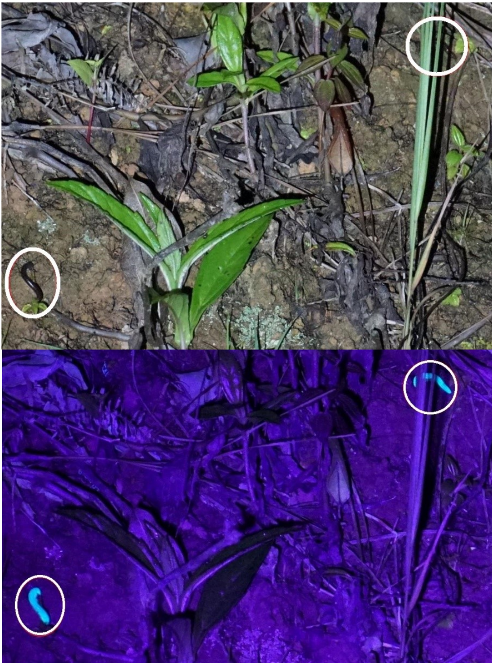
Figure 6. Simple demonstration of field counting enhancement of millipedes when using white light (above) versus UV light (below).

Future studies need to validate wavelength, distance from subjects, climatic conditions, and type of habitat among other factors to assess the potential application of UV light for nocturnal animal surveys. The evolutionary significance of fluorescence in millipedes as well as for other invertebrates, remains elusive.