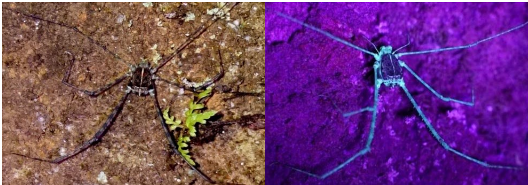
Figure 1. The harvestman Yunquenus portoricanus (Opiliones) showing its natural dark (left) and its UV induced fluorescent color (right).

Two arthropods endemic of Puerto Rico were found to fluoresce in the sampling area during the four nights' survey: the harvestman, Yunquenus portoricanus (Silhavy, 1973; Agoristenidae), and the millipede Spirobolellus richmondi . (Chamberlin, 1922; Diplopoda: Spirobolida). As far as we know, this is the first report of biofluorescence for these species. The harvestman is naturally dark brown and glowed blue green (Figure 1), a finding very similar reported for spiders (Andrew et al. 2007) and other Opiliones (Rubin et al. 2017). The following link shows the glow of Yunquenus portoricanus : https://youtu.be/mHV5DN1Ux58 .