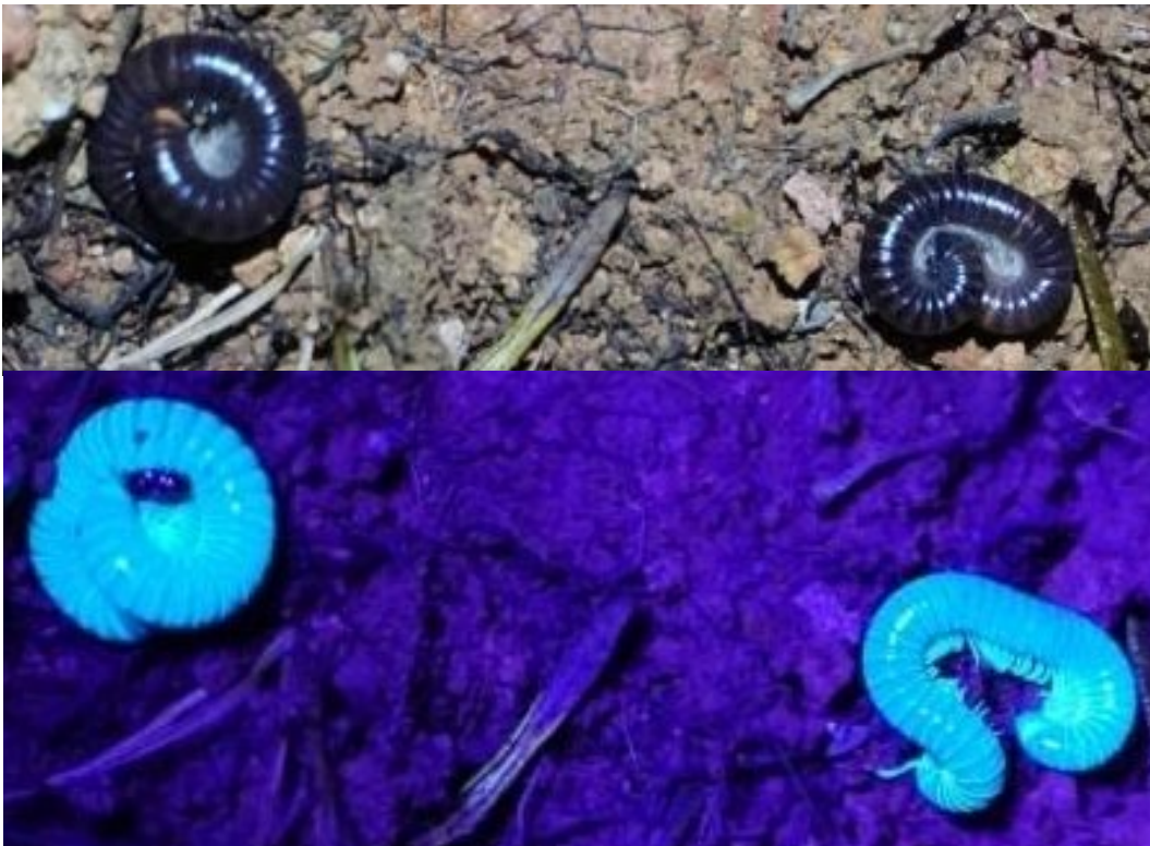
Figure 5. Comparison of a pair of Spirobolellus richmondi millipedes photographed with incident white light (upper photo) and with UV light (lower photo).

The use of UV light seems to provide advantages for population studies. UV light enhanced the detection of Yunquenus portoricanus and Spirobolellus richmondi and the unidentified opilionid, two dark nocturnal dwellers. Figures 5 and 6 depict two scenarios where the use of UV light allowed the detection of hidden or camouflaged individuals of S. richmondi . These organisms are relatively small, mobile, dark-bodied, and nocturnal dwellers, four attributes which make them almost imperceptible with white light. Although these results are preliminary, there is no doubt the application of UV light improved the detection of the above fluorescent organisms in dark and humid challenging environments, a finding very similar to that reported by Rice et al. (2015).