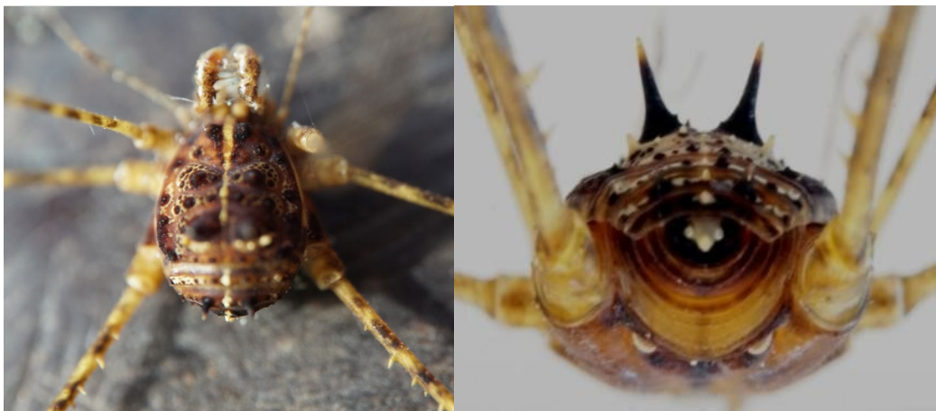
Figure 2. The harvestman Yunquenus portoricanus (Opiliones) prominent spiny opisthosoma. Dorsal (left panel). Posterior (right panel).

Thirteen species of harvestmen, most of them endemic, have been reported for Puerto Rico (Alegre-Barroso and de Armas 2012, Kury 2003). Harvestmen are omnivorous and their diet includes small, soft skinned arthropods and other invertebrates, as well as carrion, plants and fungi (Pinto-Da Rocha et al. 2007). The observed harvestmen Yunquenus portoricanus is a solitary arachnid that dwells in the humid ground of the Carite State Forest. Its body is ~0.50 cm long, while the length of the posterior and spinier pair of legs is sixfold that. According to Šilhavý (1973) and Pinto-Da Rocha and Ryotara-Hara (2009), Y. portoricanus most prominent characteristic is its relatively spiny opisthosoma, which includes two notorious spines (Figure 2). Besides its taxonomy, there is no ecological or natural history information about this species.