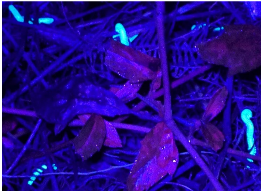
Figure 3. Glowing Spirobolellus richmondi dwelling over litterfall.

According to Vélez (1965), adult Spirobolellus richmondi are dark brown, medium sized (approximately 20-35 mm long) millipedes with a strongly hardened integument, and over 30 acarinated diplosegments. Spirobolellus richmondi often have two mid-dorsal lines consisting of pale brown spots. The antennae and legs are pale yellow to nearly white and the eyes have about 15 ocelli. The collum is narrowed laterally and does not ventrally surpass the level of the following diplosegments. The openings of the repugnatorial glands, or ozopores, when present, are located in the posterior half, or metazonite, of the diplosegments (Figure 4). The anal tergite generally does not surpass the paraprocts. The posterior margin of the epiproct is concave and posterior margin of the hypoproct is angular (Figure 4). Coleopods as in Figure 4.