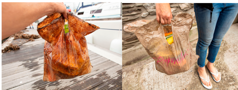
Figure 1. Oxo-biodegradable bags (oxobio2) which had either been submerged in the marine environment (left) or buried in soil (right) for over three years. Each bag is holding 2.25 kg of typical groceries.

2.3. Tensile Stress Testing. The thickness of each strip was measured using an electronic micrometer (Sealey; AK9635D). Each strip was measured at 10, 50, 100, and 140 mm from a central point. This produced four reference points for each sample and the mean was then calculated. The maximum load (N) for each strip was then measured using a tensile testing machine at a rate of 100 mm min -1 (Instron, system ID 3345 k1669, Norwood, MA, force transducer model 2519-104, capacity 500 N). Then, the maximum tensile stress of each strip was calculated using the following equations: