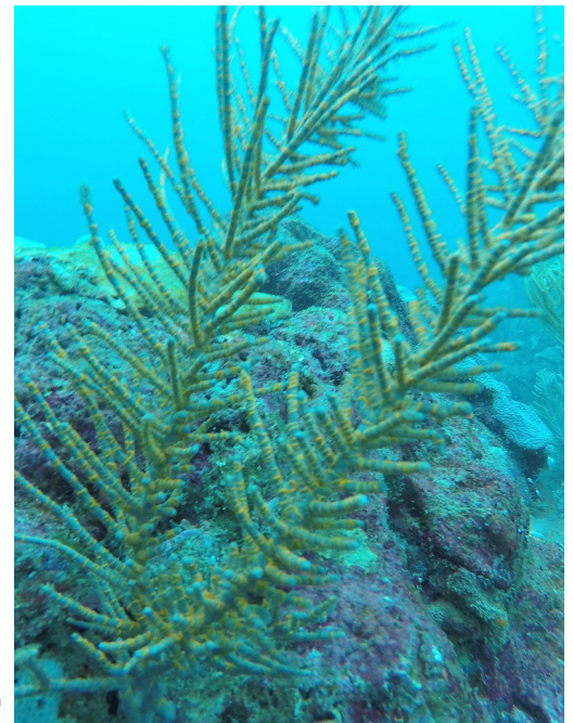
Fig. 2. Ophiothela mirabilis (yellow-orange) on host sea plume, Muriceopsis flavida .