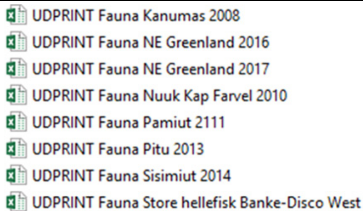
Table 1. Examples of Excel files with benthos species lists from localities in Greenland waters.

Data for the web based database include benthos species from Greenland studies identified in 2008-2018 and include 483 species (examples of Excel files in the database are listed in Table 1).