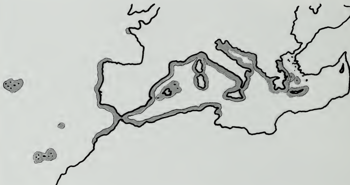
Figure 14. Distribution area of Calliostoma conulum .