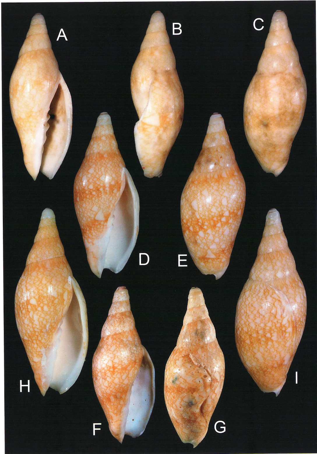
Figure 1. Notovoluta kalotinae sp. nov. Off Northwest Broome, Western Australia

A-C. Holotype Museum and Art Gallery of the Northern Territory, Darwin, P.54960, 74.3mm; D-E. Paratype 1: A. Limpus coll., 96.0 mm; F-G. Paratype 2: P. Bail coll., 69.0 mm; H-I. Other specimen: M. Zografakis coll., 97.5 mm.