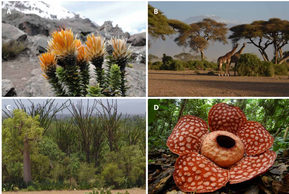
Fig. 2. Plant species from the Andes Mountains, East Africa, Madagascar, and Malaysia. (A) Chuquiraga jussieui at the base of volcano Chimborazo, Ecuador. (B) Vachellia tortilis ( Acacia tortilis ), grazed by giraffes at the foot of Mt. Kilimanjaro. (C) Alluaudia procera spiny thicket, Berenty, Madagascar. The family Didieriaceae is highly characteristic of Madagascar. Moringa drouhardii on the left, and noxious introduced Opuntia stricta in the foreground. (D) Rafflesia cantleyi , a unique parasitic plant, northern Malaysia rainforest.

fewer species than do tropical moist forests. As they expanded, they greatly reduced Africa's moist forests and left many of them as separate patches [e.g., (31)]. The separation of South America from Antarctica about 55 million years ago, eventually leading to the formation of ice sheets in the south, strongly cooled the Benguela Current, running up the west coast of Africa, and caused the spread of arid climates there too. The original rainforest, now much smaller and fragmented, also became much poorer in species of plants and animals than it had been originally (26).