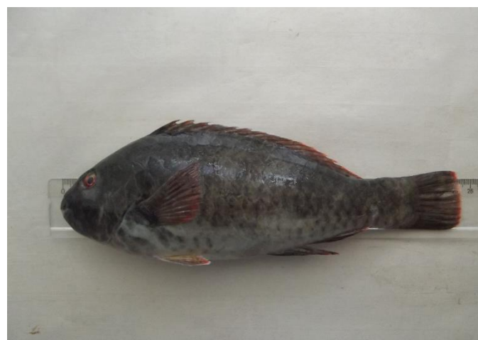
Figure 2 - Sparisoma cretense captured in the İbrice Bight (Saros Bay, Northern Aegean Sea, Turkey)

The specimen was identified based on Mater et al. (2009), photographed, some measurement and meristic characters were measured. And then, the specimen was fixed and preserved in 6% formalin solution (Figure 2).