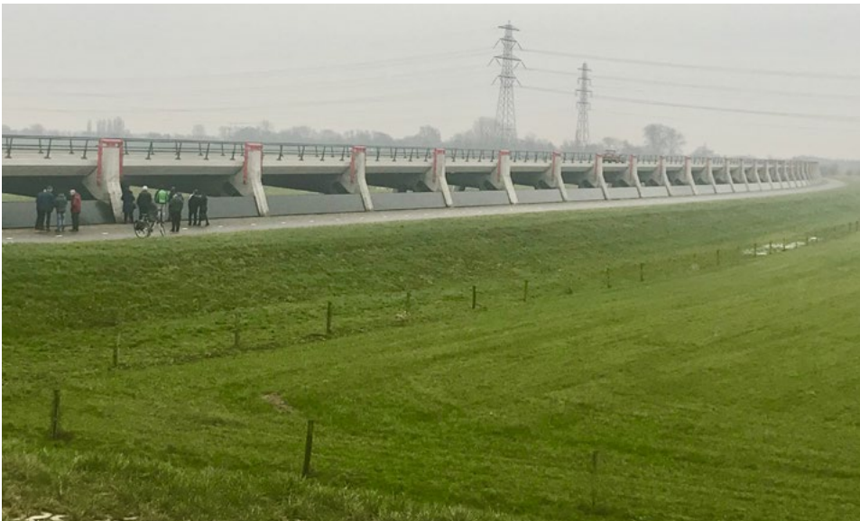
Figure 3. Creation of an additional space controlled by portable flood gates that sit under the road and within the flood plain in the IJssel region in the Netherlands (H2020 RECONNECT project demonstration site). This site is part of the “Room for the River” programme. It aims to provide flood protection, enhance the landscape and improve environmental conditions in the areas surrounding the Netherlands’ rivers.

In its demonstration and upscaling activities, RECONNECT draws on a network of Demonstrator and Collaborator schemes covering diverse local conditions, geographic characteristics, institutional/governance structures and social/cultural settings, to successfully upscale NBS throughout Europe and internationally, Figure 3.