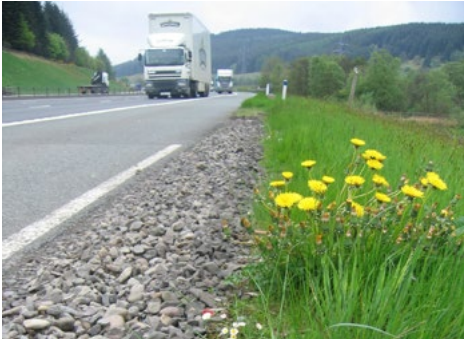
a) Filter drain, Dunfermline, Scotland.