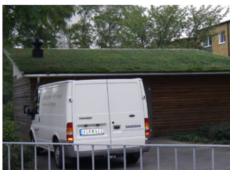
Figure 1. Examples of small (a) and large-scale NBS (b)

(a) Green roof in Malmo, Sweden. The main purpose is to reduce the stormwater runoff and mitigate flood risk. A green roof can also provide other economical, ecological and social benefits, i.e., co-benefits (e.g., purify the air, reduce the ambient and indoor temperature, save energy and enhance biodiversity in the city).