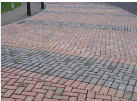
c) Permeable pavement, Dundee, Scotland.