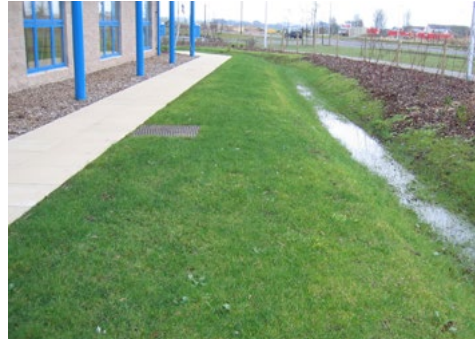
(b) Filter strip and swale, Dundee, Scotland.