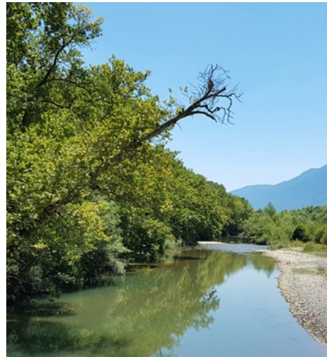
Figure 5. Sterea Ellada region is a location for OPERANDUM's Greek OAL NBS situated in the basin of the Spercheios river. It springs from the mountainous parts of the catchment, mainly from Tymfristos mountain in the West, as well as Vardousia and Oiti mountain ranges in the Southwest and South respectively and it deals with floods and droughts. This NBS also has considerable economic and biodiversity values.