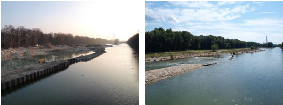
Figure 6. The Isar river (Germany) during (left) and after (right) the hydro-morphological restoration. It is one of the main tributaries of the Danube, sources in the Alps, and crosses the Bavarian capital Munich. Heavy rain events in the Alps in the years of 1999, 2005 and 2013 led to major floods. Today's near-natural landscape raises awareness on the usefulness of NBS both for DRR and recreational purposes.

PHUSICOS focuses on demonstrating the effectiveness of NBS and their ability to reduce the impacts from small, frequent events (extensive risks) in rural mountain landscapes (see Figure 6). Autuori et al., (2019) describe a comprehensive framework to verify the performances of NBS from technical and socioeconomic points of view which plays an important role in the overall evaluation of measures. Further results concerning application and verification of this framework will prove its usefulness and contribution towards the three policy documents with particular reference to hazards and risks in mountainous settings.