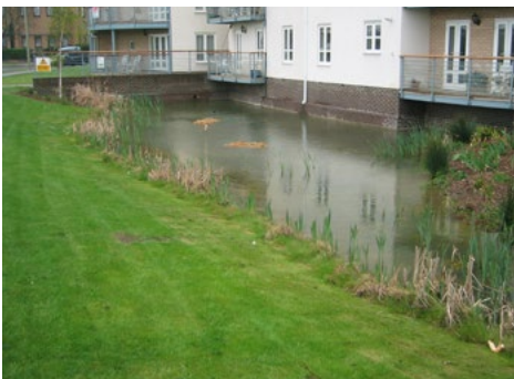
e) Pond, Bicester, England.