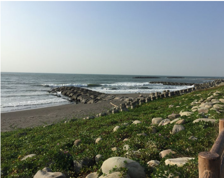
Figure 7. Coastal flood risk reduction with hybrid measures (i.e., combination of hard engineering and Ecosystem-based approaches) in Taiwan, FP7 PEARL project.

in urban areas. The work has also addressed application of NBS measures in areas with cultural heritage (e.g., Vojinovic et. al., 2016a; Vojinovic et. al., 2016b). This could be particularly relevant for FD (e.g. Chapter II, Article 4), APSFDRR (e.g. Key Area 4 - Supporting the development of a holistic disaster risk management approach in relation to cultural heritage), and SACC as well as for other directives for Member States that aim to address cultural heritage requirements.