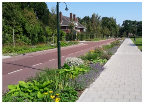
f) Streetside rain garden, Eindhoven, Netherlands. (UNaLab project.)