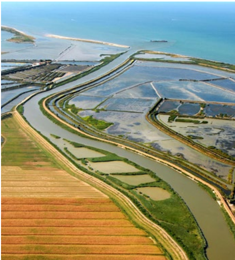
Figure 4. Po Valley (Panaro river, Comacchio valleys, Reno, Emilia Romagna coastal area), Italy, is part of the OALs within the H2020 OPERANDUM Project. The delta of Po river represents the transition between the river and the sea with differing hydraulic, morphological and biological characteristics. The NBS addresses multiple hazards such as floods, droughts, coastal erosion and storm surges and it also presents economic and biodiversity values.

OPERANDUM combines ten NBS sites, or Open-Air Laboratories (OALs) covering a wide range of hazards, with different levels of climate projections, land use, socio-economic characterization, existing monitoring activities and NBS acceptance (see Figures 4 & 5). Renaud et al., (2019) provide a systematic literature review on vulnerability and risk assessment frameworks addressing natural hazards, focusing on NBS. Their contribution to EU policy implementation, and particularly FD, relate to the selection and use of indicators for measuring social and ecological vulnerability to natural hazards, and how these indicators can be used to assess the success of NBS in reducing vulnerability and risk.