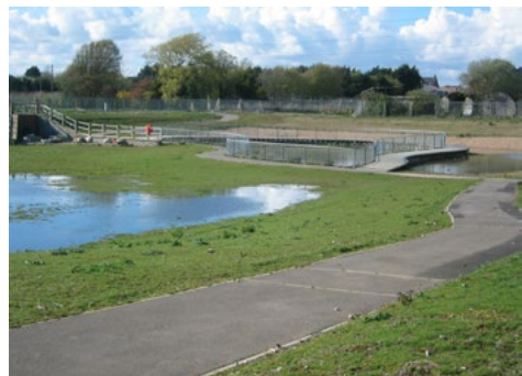
d) Infiltration Basin, Angmering, England.