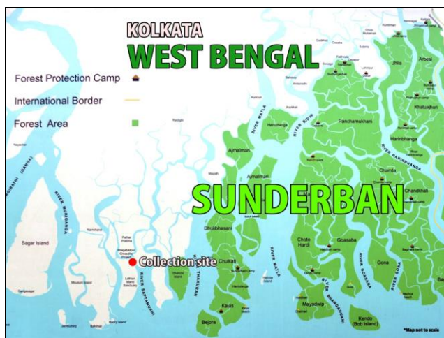
Fig 1: Map of the Sunderban Biosphere Reserve and the collection site

The specimens were collected from the northern part of Lothian Island Wildlife Sanctuary (88°18.696'E, 21°42.340'N), situated at the confluence of river Saptamukhi and the Bay of Bengal on 12.10.2019 (Figure 1). The specimens were obtained from the vacant shells of Telescopium Montfort, 1810. Specimens along with the molluscan shells were collected by handpicking and the hermit crab samples were separated, photographed and preserved in 10% Formalin –freshwater solution. In laboratory, the specimens were measured using a slide calliper with a minimum measurement capacity of 0.1mm. Specimens and the host molluscan shells were identified in the lab. Identification keys used for identification of the hermit crabs were as per Thomas, 1989 [3]. Voucher specimens are deposited in the National Zoological Collections of ZSI-Sunderban Regional Centre.