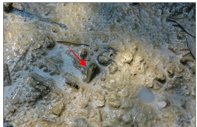
Fig 3: Natural habitat of Clibanarius longitarsus De Haan, 1849 in Sunderban Biosphere Reserve

Diagnostic characters: Well developed carapace with spines projecting outwards and the carapace is broader at the proximal end of the body. Eye stalk is as long as the antennular peduncle. Chelipeds are equal in length; left cheliped is slightly larger than the left. Both chelipeds are with dark corneous tips. One or two rows of spines are present on chelipeds and irregularly placed spines are present on palm. Dactylus of the third walking leg is longer than the