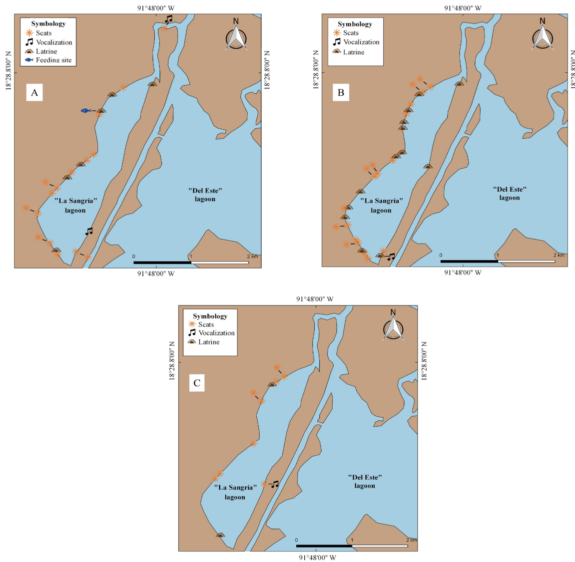
Figure 2. Spatio-temporal distribution of indirect evidence of Neotropical otter in La Sangría Lagoon, Palizada, Campeche, México. A) Winter rainy season ( nortes 2016). B) Dry season (2017). C) Rainy season (2017).

sal fins, and, particularly, dermal plates. The janitor fish showed a total percentage of occurrence of 14.28 % during the sampling period, with the highest percentage in the rainy season (26.70 %), followed by the winter rainy season ( nortes ; 15 %) and the dry season (11.30 %).