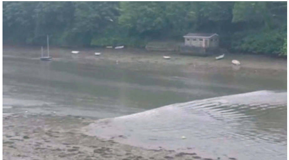
Figure 1. Screen shot of the video of the Yealm meteotsunami from figure 8 in Tappin et al. (2013).

On the 31 May 1759 Perrey (1849) reported that the sea ... flowed in and out three times during an hour... This is consistent with a