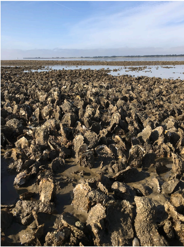
Fig. 1. Biogenic reef of the Pacific oyster Magallana gigas.