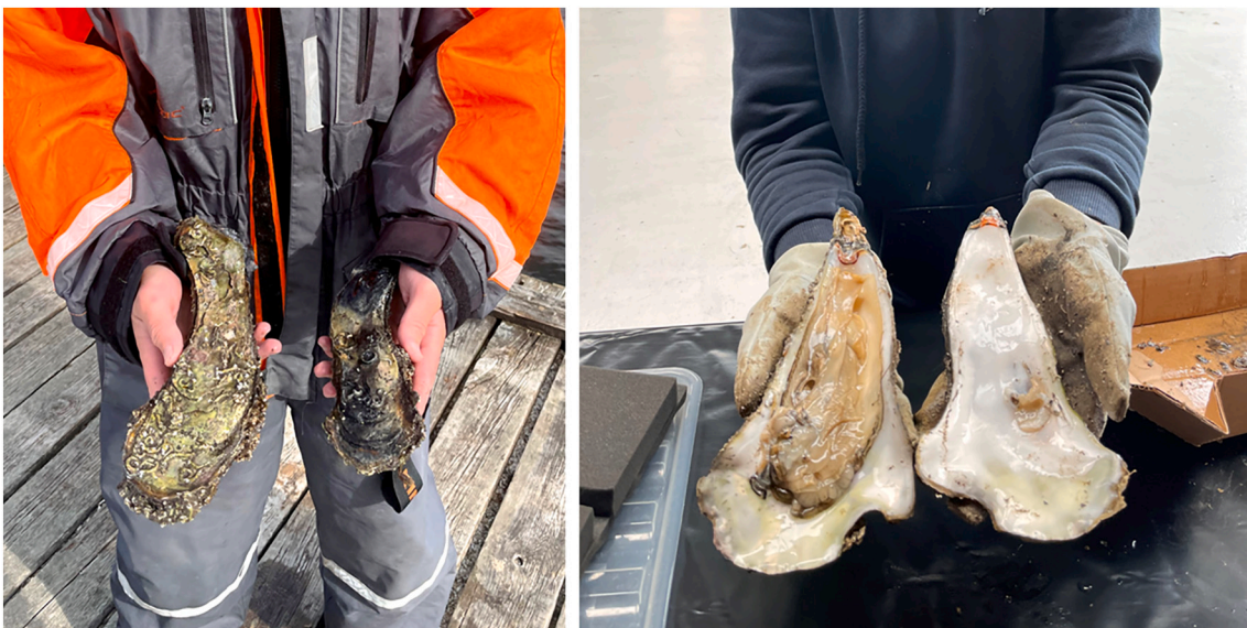
Fig. 2. Individual Pacific oyster Magallana gigas shells (left) and soft parts (right)