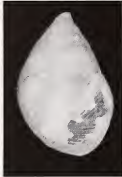
Plate 79. Laemodonta cubensis Pfeiffer. Bonefish Key, Lower Florida Keys (9.4x).

Remarks. This is the only species of Laemodonta to occur anywhere in the Atlantic and here it is limited to southern Florida, Bermuda, and the West Indies. The remaining species in this genus are all from the Indo-Pacific.