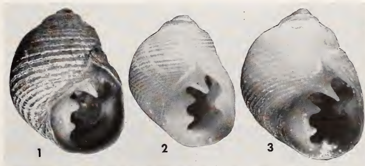
Plate 76. Pedipes mirabilis v. Mühlfeldt. Fig. 1. Cabo Rojo lighthouse, Puerto Rico (11.5x). Fig. 2. Lectotype of Pedipes ovalis C. B. Adams (= mirabilis v. Mühl.) MCZ, no. 177349. Fig. 3. Lectotype of Pedipes globulosus C. B. Adams (= mirabilis v. Mühl.), Jamaica (12.5x) MCZ, no. 177347.

The two species are colonial, very similar to the condition prevailing among the marine species in the Truncatellidae. A colony becomes established, flourishes for a time, then may disappear when factors in the environment become impossible for its survival. They seem to prefer a hard substrate such as rocks or oyster shells, situations where there are crevices or other irregularities in which to crawl.