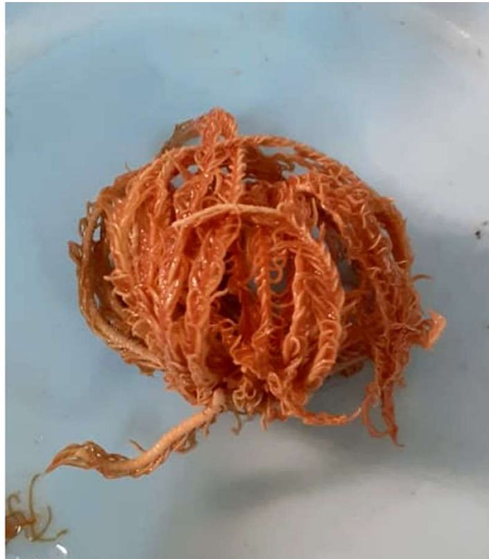
Figure 1 Comanthus wahlbergii (Müller, 1843)