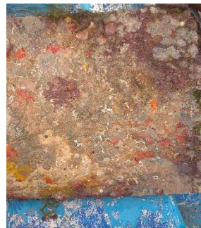
Figure3. B. neritina colony on the artificial reef