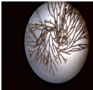
Figure 2. B. neritina colony

B. neritina is Flexible dense colonies, 7 cm high, pinkish-brown, branched in pairs. Zooids are white, spherical, and has a pointed outer corner. Zooids average 0.90 x 0.25 mm (Figs. 2, 3, 4).