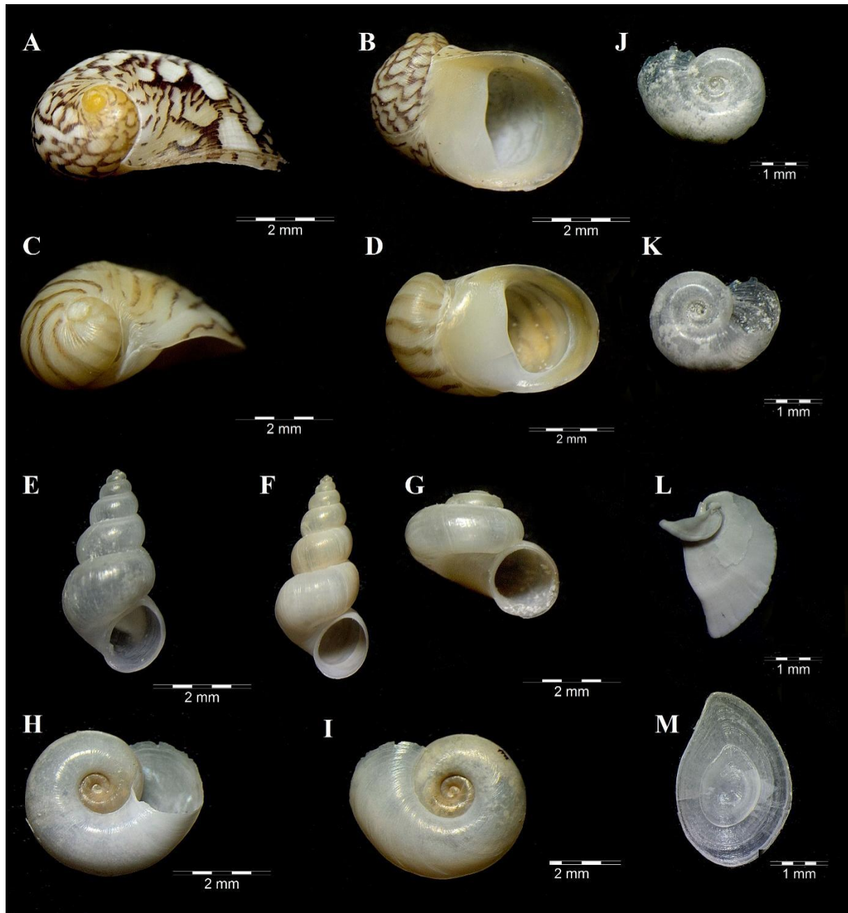
Figure 2. A-B. Theodoxus fluviatilis, C-D. T. major, E. Ecrobia maritima, F. E. ventrosa, G. Valvata macrostoma, H-I. Gyraulus piscinarum, J-K. Armiger crista, L. operculum ( T. fluviatilis), M. operculum ( Bithynia sp.).