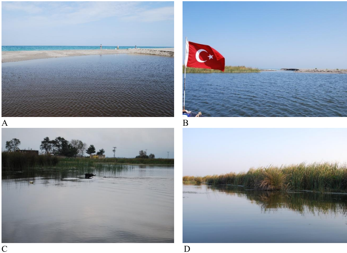
Figure 3. A-B. Connection of Karaboğaz Lake and Liman Lake with the sea; C. Livestock activities (buffalo farming) carried out in the research area; D. Liman Lake-4 station from the research area.

close to the sea and partly isolated from the sea by dunes formed due to sea waves (Figure 3).