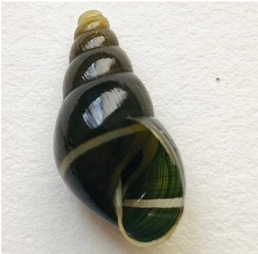
Figure 1. Specimen of Zoniferella vespera from Otonga Reserve, province of Cotopaxi, Ecuador, deposited at the Museo de Zoología (ZSFQ), Universidad San Francisco de Quito USFQ.

Herein, we present new distributional records of Zoniferella in Ecuador, expanding its range across northwestern Ecuador, providing the first descriptions of its morphological and colouration variation, and commenting on the taxonomy of the genus.