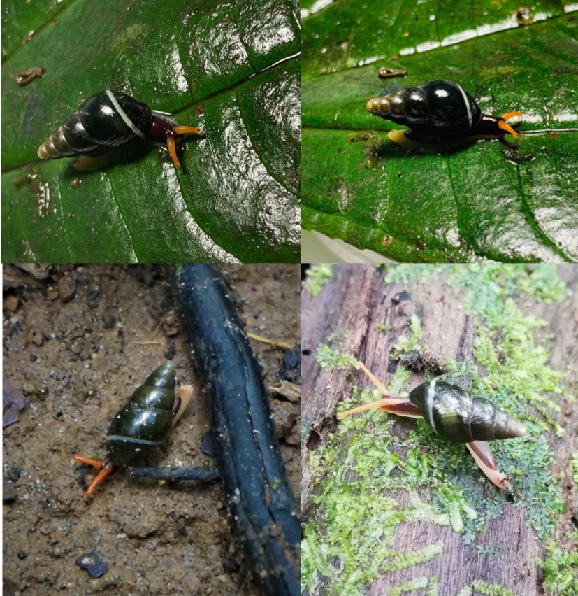
Figure 2. Variation of colouration in life of Zoniferella vespera . Top: Otonga Reserve, province of Cotopaxi, Ecuador, photo by R. Valencia. Bottom left: Un Poco de Chocó Reserva, Pachijal, province of Pichincha, Ecuador, photo by jÓrdis, iNaturalist (CC-BY-NC). Bottom right: Estación Mindo USFQ, province of Pichincha, Ecuador, photo by Giovanni Ramón, iNaturalist (CC-BY-NC-SA)

Two individuals of Zoniferella were found at the Otonga Reserve (0°26'24" S, 78°43'19" W; 1815 m), county of Sigchos, province of Cotopaxi, Republic of Ecuador, on top of leaves of Melastomataceae and Araceae, in a very narrow, steep, and rocky ravine covered by old-growth dense forest, near the main station house, on 28 May 2021 by Roberto Valencia (Fig. 1–2). The snails were photographed alive. One specimen was deposited at the Museo de Zoología, Universidad San Francisco de Quito, Ecuador (ZSFQ) (Fig. 1). Photographs of one of these snails were posted in iNaturalist [11] (Fig. 2), where initial generic identification was provided. We confirmed the generic identification and restricted the species to Z. vespera , based on information provided by Pilsbry, Jousseau and Cousin [1,3,12] and examination of photographs of the holotype [13]. Snails were identified as Zoniferella vespera due to the presence of the following diagnostic characteristics: shell ovate-acuminate, thin, delicate, very glossy, decorated with very thin irregular ridges; 6 whorls; spire long, conic; apex obtuse; aperture oval;