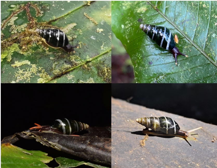
Figure 4. Variation of colouration in life of Zoniferella riveti var. bizonalis / Z. bicingulata .

Photographs reported in iNaturalist of individuals with two bands on the last whorl ( Z. riveti var. bizonalis / Z. bicingulata ) usually differ by having the tentacles completely dark like the dorsal surfaces of foot and head, except for the eyes that are cream (Fig. 4). However, one individual showing two bands has the same colouration described for Z. vespera [32]. Another has tentacles completely cream-coloured and a whitish band running towards the back from the base to each tentacle [33] (Fig. 4).