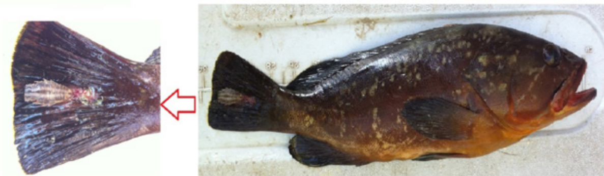
Figure 2. Nerocila bivittata on the caudal fin of Ephinephelus marginatus and hemorrhagic lesion.