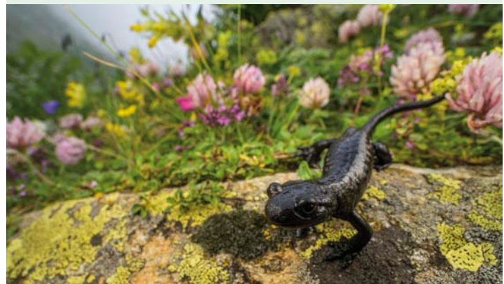
Lanza's salamander, endemic to Cottian Alps, Monviso massif, Italy.

This could also consider potential synergies with other EU targets, in particular in relation to climate policy or the EU's new Nature Restoration Plan.