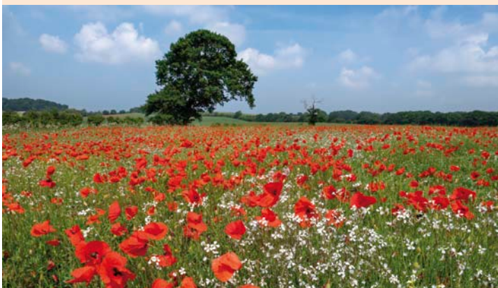
Corn poppies in bean crop field.

If, by 2024 Member States have not made sufficient progress in designating sites, the EU will consider whether stronger actions, including EU legislation, are needed.