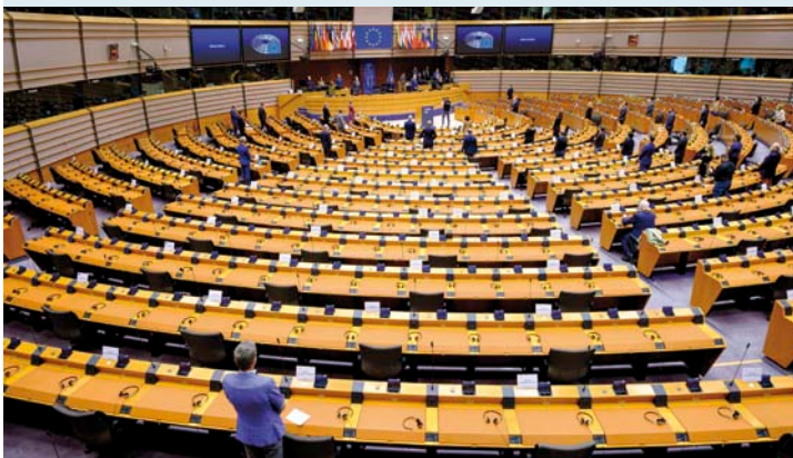
Hemicycle of the European Parliament.

The Commission will assess the progress and suitability of the cooperation-based approach in 2023, and consider whether a legally binding approach to governance is needed.