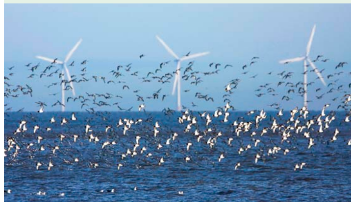
Oystercatchers, Haematopus ostralegus , in flight with offshore wind turbines.

It will also review in 2021 the data on biofuels with high indirect land-use change risk, and establish a trajectory for their gradual phase-out by 2030.