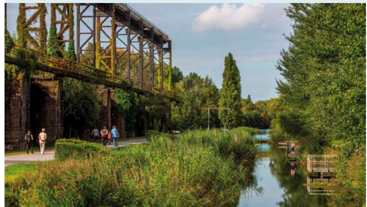
Duisburg-Nord Landscape Park, former Thyssen Stahlwerk, in Duisburg, Germany.

Through its existing B@B platform, the Commission will continue to support the development of a European Business for Biodiversity movement. It will also work with business to create incentives and eliminate barriers for the take-up of nature-based solutions that can lead to significant business and employment opportunities in various sectors, and are the key to innovation.