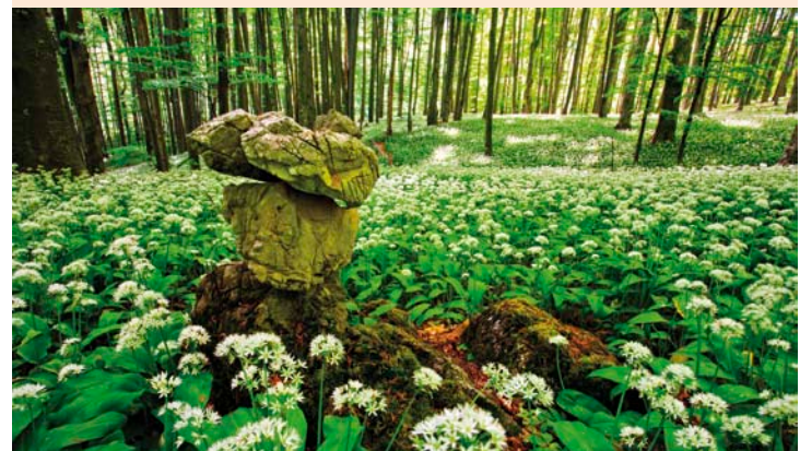
Forest with wild garlic in Central Balkan national park.

Again, if, by 2024, Member States have not made sufficient progress in designating sites, the EU will consider whether stronger actions, including EU legislation, are needed.