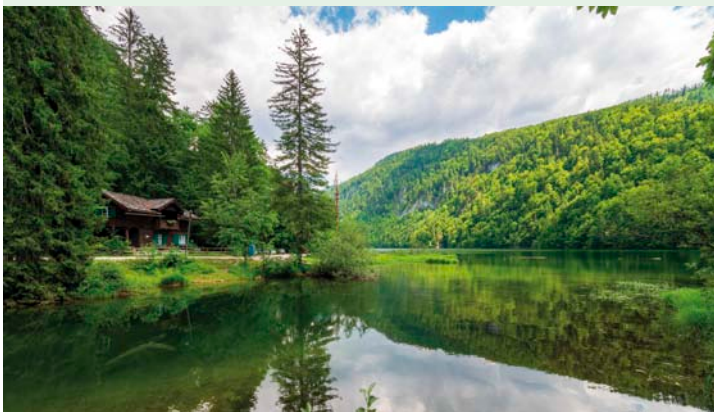
Lake Toplitz, Styria, Austria.

The legislative proposal will target all degraded ecosystems and, in particular, those with the most potential to capture and store carbon, and to prevent and reduce the impact of natural disasters. Subject to a comprehensive impact assessment, the legislative proposal will define the conditions in which the targets must be met, as well as the most effective measures to reach them.