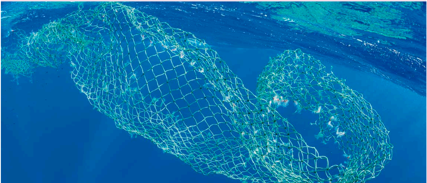
Phantom fishing net drifting in the Caribbean Sea.

The Commission will consider launching or joining other High Ambition Coalitions to help develop the post-2020 framework.