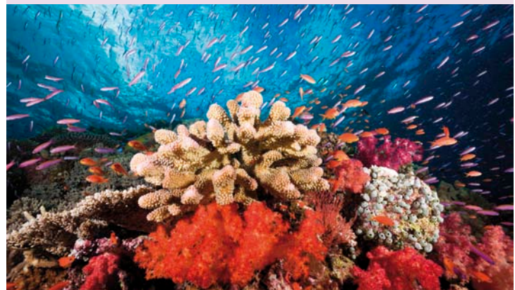
Coral Reef, Namena Marine Reserve, Fiji.

In international negotiations, the EU will continue to advocate that marine minerals in the international seabed area cannot be exploited before the effects of deep-sea mining on the marine environment, biodiversity and human activities have been sufficiently researched, the risks are understood and the technologies and operational practices are able to demonstrate no serious harm to the environment.