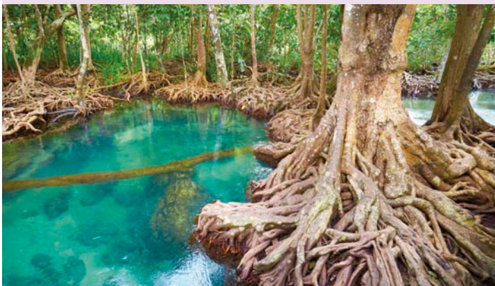
Mangrove forest in Tha Pom Khlong Song Nam National Park, Thailand.