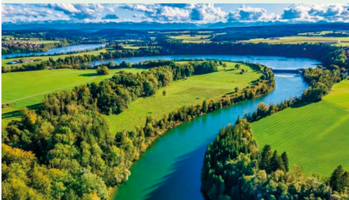
Loop of the Lech river, Upper Bavaria, Germany.

Member State authorities should also review water abstraction and impoundment permits to implement ecological flows in order to achieve good status or potential of all surface waters and good status of all groundwater by 2027 at the latest, as required by the Water Framework Directive.