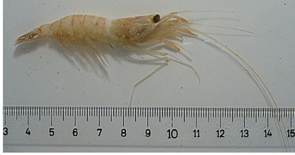
Figure 4. Processa canaliculata Leach, 1815 ♀, Siğacık Bay (lateral view). TL: 64.2 mm

Worldwide Distribution: Eastern Atlantic, Mediterranean ( d'Udekem d'Acoz, 1999 ).