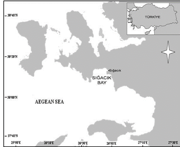
Figure 1. Map of the study area

All decapod crustaceans are determined to species level using the studies by Zariquiey Álvarez (1968), Noël 1992, Ingle (1993), and Falciai and Minervini (1996). In addition, WoRMS (2024) is considered for synonyms of the species and also variations in the nomenclature.