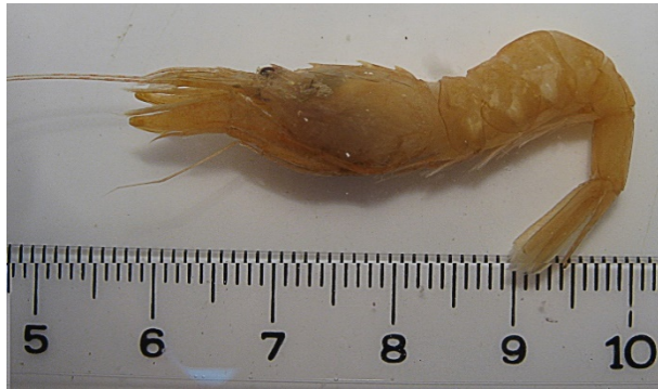
Figure 5. Pontophilus spinosus (Leach, 1816) ♂, Siğacık Bay (lateral view). CL: 11.7 mm TL: 48.3 mm

Worldwide Distribution: Eastern Atlantic, Mediterranean ( d'Udekem d'Acoz, 1999 ).