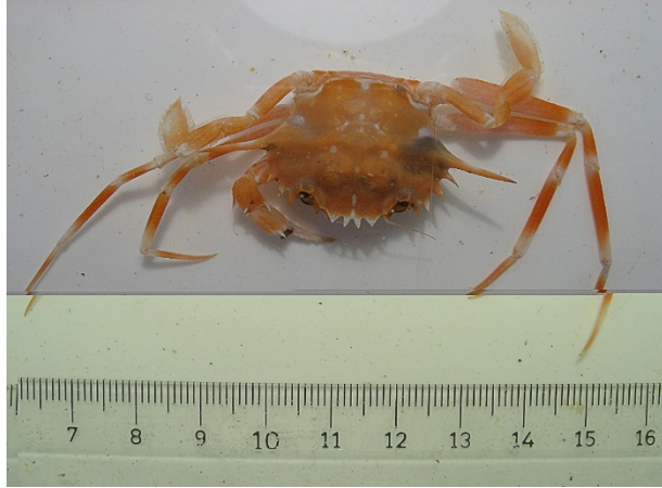
Figure 3. Bathynectes maravigna (Prestandrea, 1839) ♂, Siğacık Bay (dorsal view). CL: 41.6 mm

Worldwide Distribution: Eastern Atlantic, Mediterranean (d'Udekem d'Acoz, 1999).