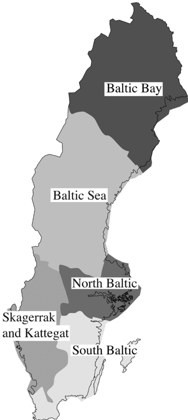
MAP 4.1 Catchment areas in Sweden as divided through the transpositioning of the WFD ILLUSTRATION CREATED BY HILLEVI DUUS