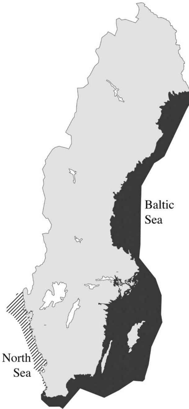
MAP 4.2 Swedish marine management areas as divided through the transpositioning of the MSFD ILLUSTRATION CREATED BY HILLEVI DUUS