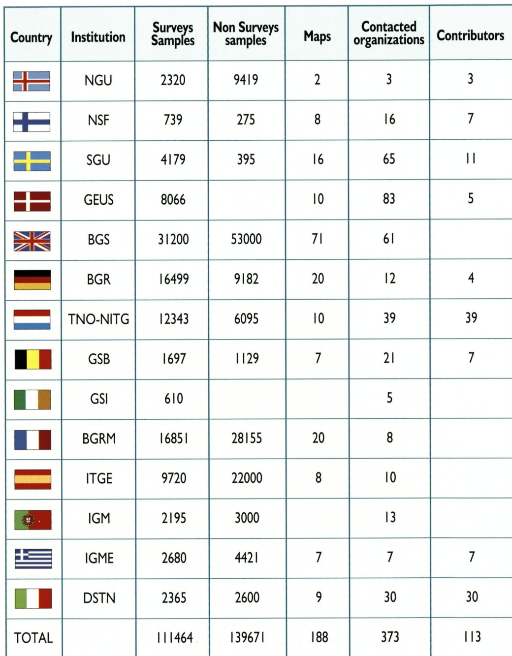
Table 2: Estimated numbers of samples identified during EUMARSIN project