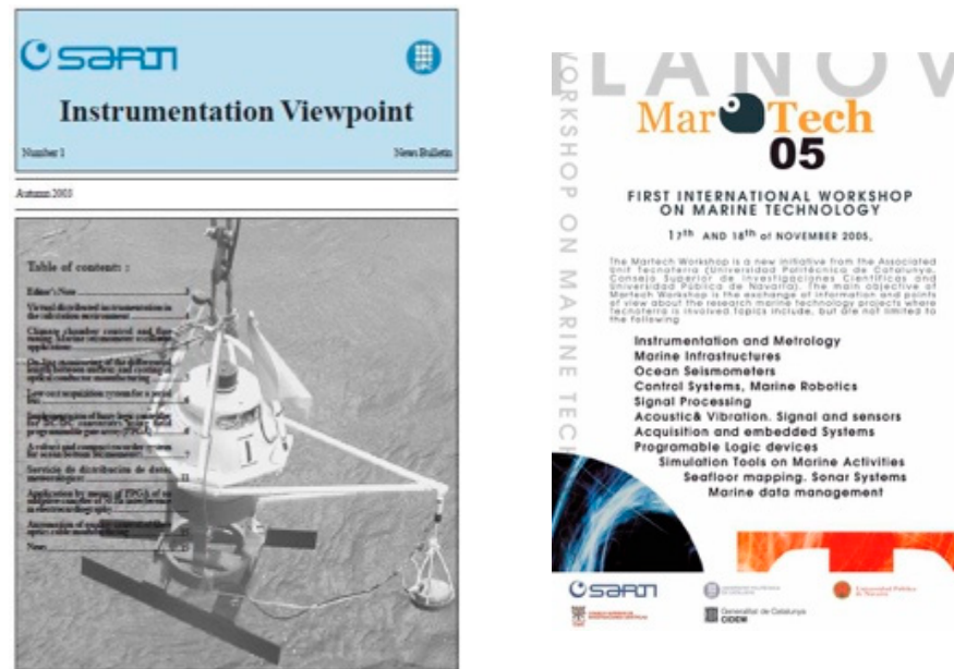
Figure 3. Cover of the first edition of Instrumentation Viewpoint and the poster of the first edition of the marine technology workshop.

Final-year students in the Marine Sciences and Technologies degree program can publish an article in Instrumentation Viewpoint and/or present work at the Martech conference, both excellent opportunities to engage in the development of marine-applied technologies (see Figure 3).