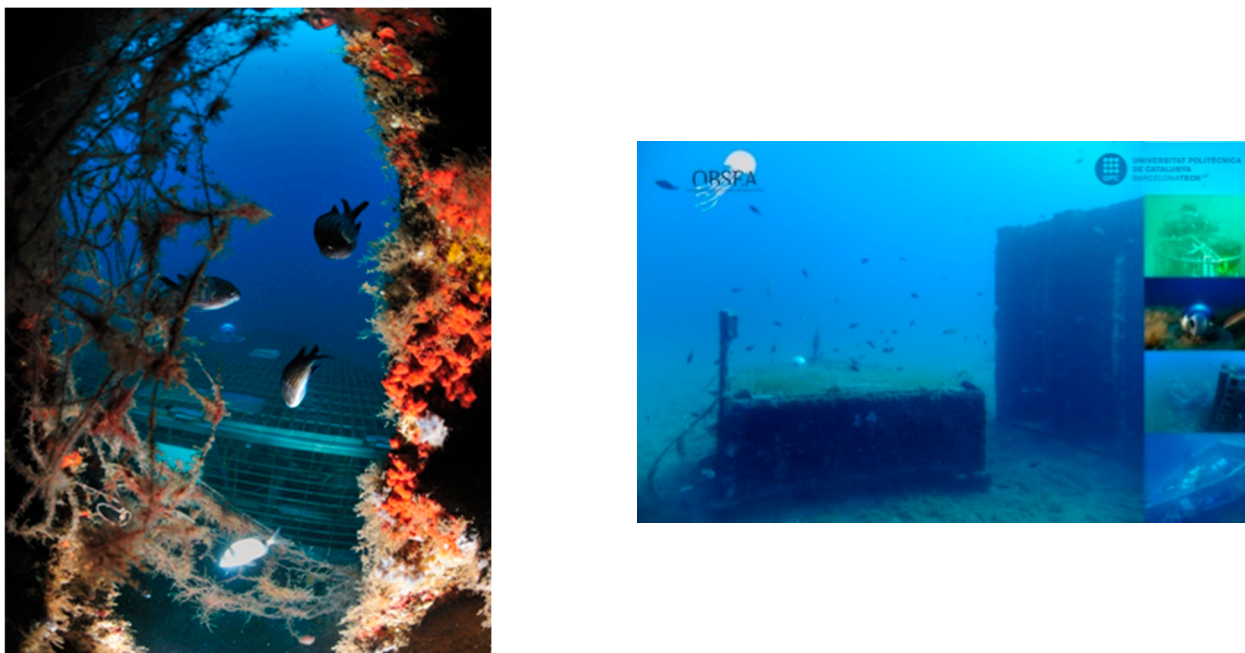
Figure 2. Underwater view of the Obsea observatory and the artificial reefs.