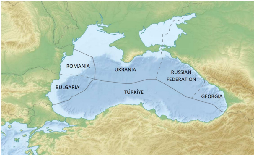
Figure 1. Black Sea, surrounding countries and Exclusive Economic Zones (modified from MarineRegions.org., Flanders Marine Institute 2023)

The Black Sea is bordered by six countries: Bulgaria, Georgia, Romania, Russian Federation, Türkiye, and Ukraine. They had been agreed on Exclusive Economic Zone (EEZ) in the Black Sea (Figure 1), established in accordance with the United Nations Convention on the Law of the Sea (UNCLOS) of 1982. Each country have national sovereignty in their EEZ and related arrangements for fisheries management.