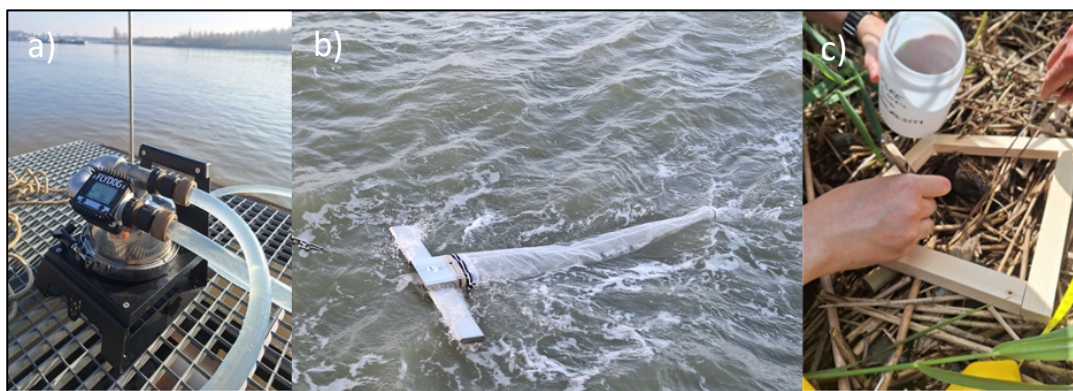
Figure 1. Sampling methodologies used in this study, to assess microplastics abundance in various matrices: (a) the Ferrybox sampling system, (b) the manta net, (c) the riverbank quadrat.

The samples used for analysis were obtained using different sampling methods. The first method relied on sampling using a Ferrybox (Fig. 1.a) 5 , a semi-automated device that collects (sea)water and retains microplastics and other microlitter, at a specific water depth. It consists of a collection module that uses a series of sieves to sort the plastics within different size fractions, which is then connected to the Ferrybox system itself that is onboard a research vessel or connected to a submerged pump. In addition, the volume of filtered water and flow rate within the collection module can be recorded 5 . A second sampling method used was the manta net (Fig 1.b) 5 , a device designed to sample plankton, but now adapted for the collection of microlitter and microplastics that are floating or are within the first few centimeters of the water column. The microplastics were extracted from the obtained samples using established standard operating procedures 7 and the analysis of the particles was performed using an automated decision-making model, that detects and identifies plastic particles using images taken with a fluorescent microscope under different filters 7,8 . Following this, the microplastics presence and the polymer identification were verified using \mu -Fourier transform infrared (FTIR) spectroscopy 7 .