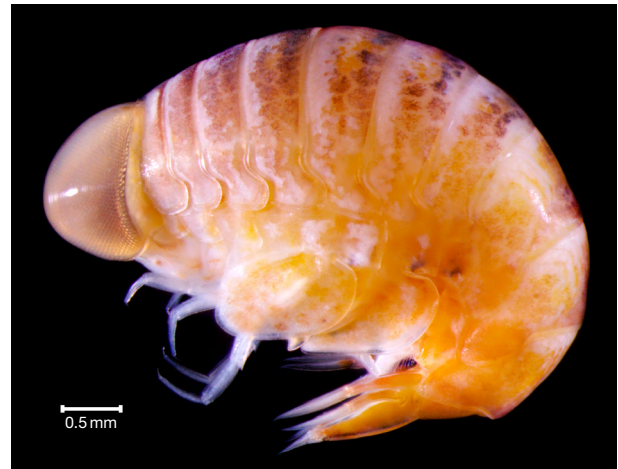
Fig. 2. Parapronoe parva Claus, 1879, adult female, 7.7 mm, habitus. Scale bar = 0.5 mm.

Pereopod 5 (Fig. 3G), basis elongate, expanded, 1.59 ×