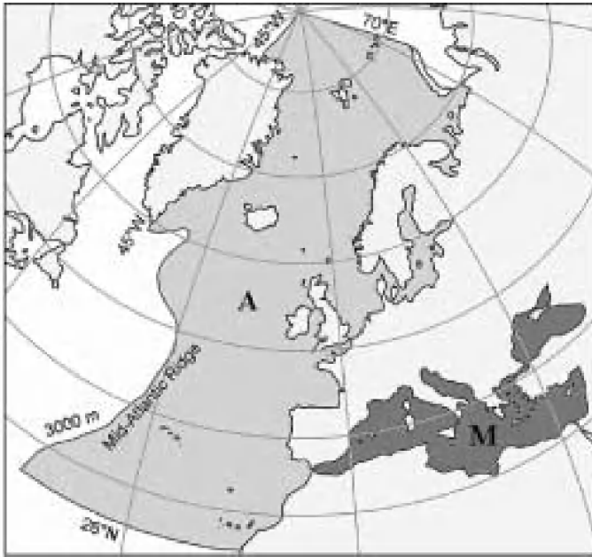
Figure 1. The geographic scope of the ERMS project. A = Atlantic Ocean including Arctic and Baltic Sea, M = Mediterranean Sea and Black Sea.

It is anticipated that the Register will become a standard reference and technological tool for marine biodiversity training, research and management in Europe. The species register can be used to: