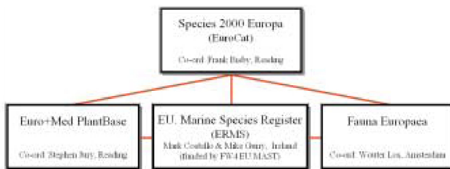
Fig 2. A diagram produced by Species 2000 in 1998 to illustrate the plan for a complete list of all species in Europe.

gaps in ERMS 1.0. In addition, additional experts are being approached to increase direct involvement of regional experts.