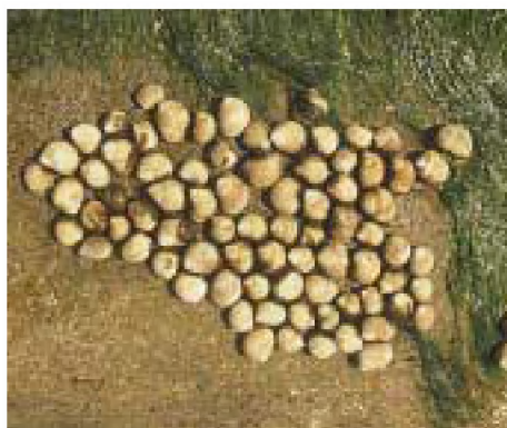
Littorina littorea : single scientific names are still not used even for common species.

Another data management component of MARBEF is to connect existing databases around Europe that have species distribution