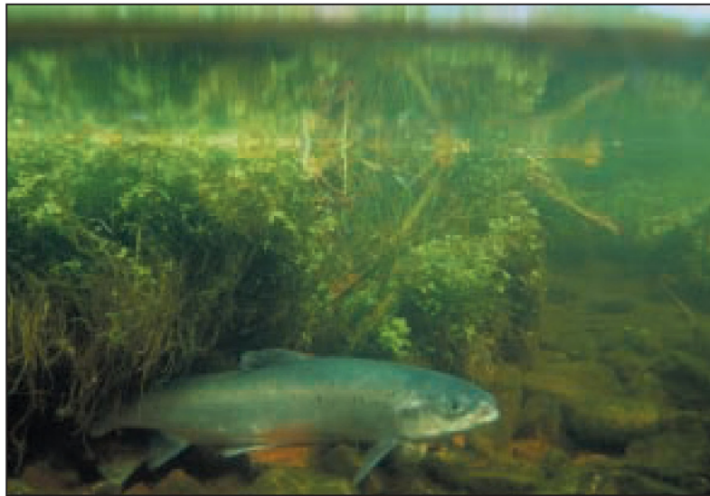
Figure 5. Wild Atlantic salmon.

Producing a kilogram of salmon releases approximately 0.02 to 0.03 kg of N, excluding losses from uneaten feed (Brooks and Mahnken 2003). About 70 000 mt of salmon were produced in British Columbia in 2003 (C Matthews pers comm) with a gross domestic product value of C$91 million, or approximately US$66 million (Marshall