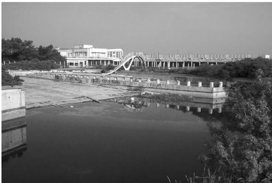
Fig. 6a. The Swimming Pool – complex.

Having learnt from previous experiences, especially the poorly prepared demolition of the Home Georges Theunis building, the preparation of the demolition and earthworks for the former Swimming Pool was contracted out to an engineering consultant. Of course the target habitats were determined by the Nature Division on the basis of the potentialities offered by the area itself: