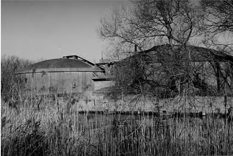
Fig. 7a. A part of the derelict water treatment plant at Groenendijk.

The humid hayfields that remained were heavily fertilised for many years in the past. Nevertheless after a couple of years of management by mowing and grazing without fertilizing, the biologically valuable humid dune-slack vegetation has already been able to restore itself to such a degree that species like Tubular Water-dropwort ( Oenanthe fistulosa ), Ragged-Robin ( Lychnis flos-cuculi ) and Western Marsh-orchid ( Dactylorhiza majalis ) have reappeared.. An old record of Creeping Marsh-wort ( Apium repens ) on the site or in the immediate surroundings underlines the potentialities of the area. The Ecosystem-perspective for the Flemish Coast (Provoost et al. , 1996) mentions the following potentialities for nature development: