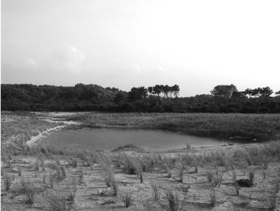
Fig. 6c. On the former location of the open-air swimming pool a permanently inundated pond was built. This habitat corresponds with '3140 Hard oligo-mesotrophic waters with benthic vegetation of Chara formations' (situation in September 2004).