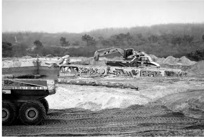
Fig. 6b. The demolition of the Swimming Pool-complex.

Just to give an idea of the extent of the project, it included the removal of: