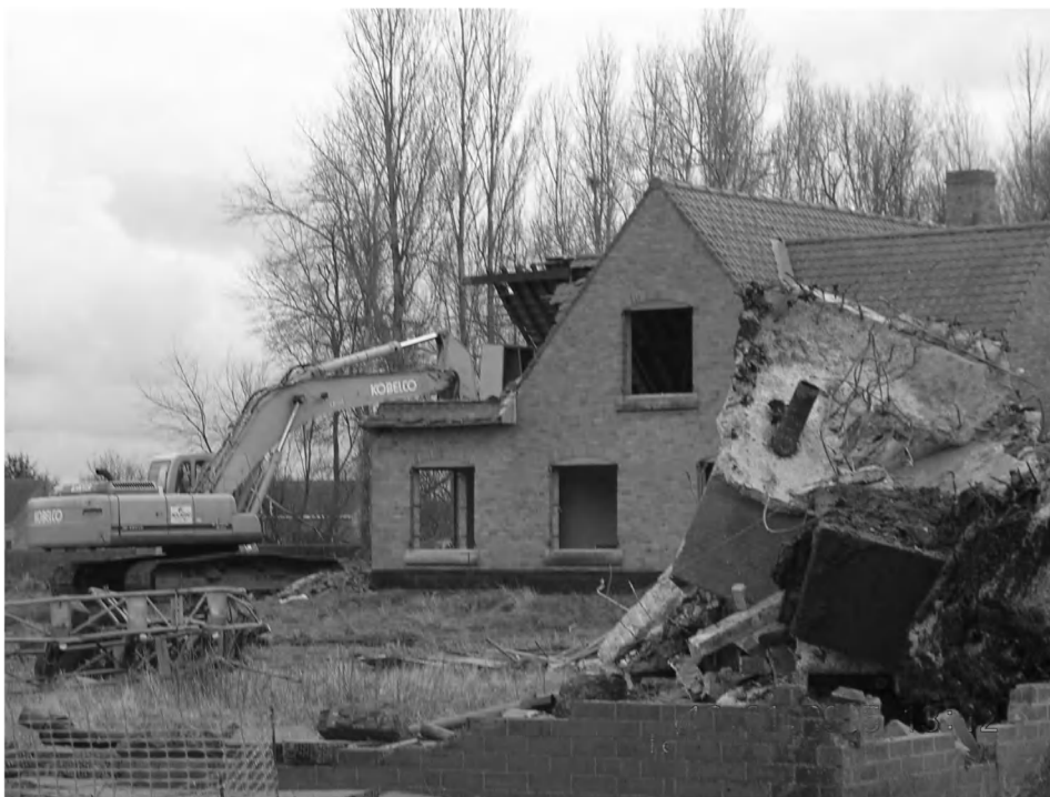
Fig. 7b. The demolition of the derelict water treatment plant at Groenendijk.

The works started on the 11 January 2005. These works involve the removal of 810m 3 of polluted sludge, 2,042m 2 of uild-up area, 5,100m 2 of concrete surface, 620m of pipes, and a displacement of soil of 30,910m 3 (Fig. 7b). As part of the LIFE nature-project 'FEYDRA' a multidisciplinary scientific monitoring-project is carried out to study the natural development of the demolition site.