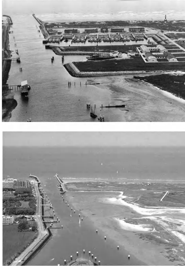
Fig. 4. Aerial photograph of the Yzer-rivermouth in 1957 and 2004.

In 1993 the Ministry of Defence announced that the Naval Basis of Nieuwpoort would be sold off. To prevent real estate speculation, the former Naval Basis was designated as a 'protected dune site' within the framework of the Decree on the Protection of the Coastal Dunes by Order of the Flemish Government of November 16, 1994. In 1995 its status on the Town and Country Planning Map was changed into "natural area with scientific value". To implement the several protection-statuses of the Yzer-rivermouth area, a plan for the restoration of its natural habitats was commissioned by the Nature Division of the Ministry of the Flemish Community to the University of Ghent. This 'Nature Restoration Plan for the Yzer-rivermouth' was finalised in 1996. The former Naval Basis was transferred from the federal Ministry of Defence to the Flemish Region in December 1998. Finally the area of the 'Yzer-rivermouth' was designated as a 'Flemish Nature Reserve' by the Ministerial Order of March 3, 1999. The specifications for the demolition of the former military harbour were deduced from the 'Nature Restoration Plan for the Yzer-Rivermouth' by a contracted civil engineering consultant. The Ecosystem Perspective for the Flemish coast (Provoost et al., 1996) identified transitions between salt-marshes and dunes and the possibility of restoring mud flats and