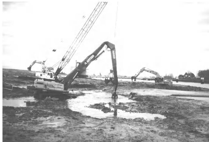
Fig. 5. Phase 2: the 'wet works' or the removal of the jetties and quays of the former Military harbour.

Also a volume of 178,000m 3 of soil was dug out, of which 35,000m 3 was transported to destinations outside the nature reserve. The remaining volume of sand that was excavated from the quays around the slipway was used for creating dunes above the pits left by the removal of the buildings ('dry works').