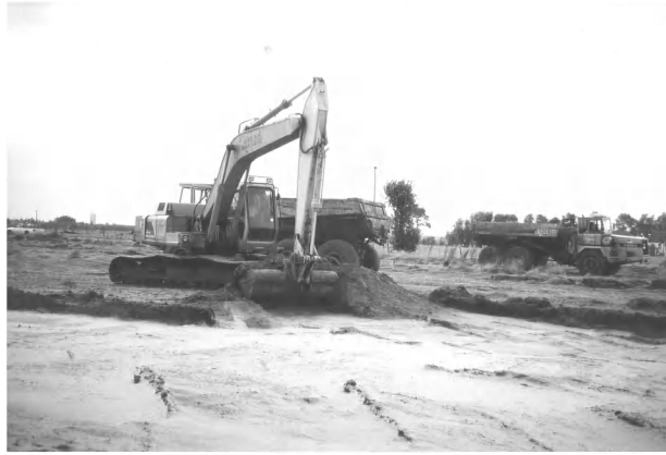
Fig. 3. 1999: The excavating of a fertilised area in D'Heye at Bredene to restore '2190 humid dune slacks' and '2150 EU-Atlantic decalcified fixed dunes ( Calluna-Ulicetea )'.

The dug out soil from both locations was spread out over a zone containing the stony remnants of a tramway and demolition material from bunkers with a total surface area of 2.2ha. The displaced earth was spread in such a way that a slightly undulating relief was created. About 8,200m 3 of soil was displaced within the framework of these nature restoration works. Target-habitats of this project were '2190 Humid dune slacks' and '2150 EU-Atlantic decalcified fixed dunes ( Calluna-Ulicetea )'. The results obtained are satisfactory and include the appearance in the excavated areas of Three-nerved Sedge ( Carex trinervis ), Glaucous Sedge ( Carex flacca ) and Lesser Centaury ( Centaureum pulchellum ) on lime rich soils and Heath-grass ( Danthonia decumbens ), Tormentil ( Potentilla anglica ), Oval Sedge ( Carex ovalis ) and Montia minor on decalcified soils. Even the vegetation of the area that was heightened with the excavated soil includes plant species that are typical for decalcified fossil dunes, such as Broom ( Cytisus scoparius ) and Gorse ( Ulex europaeus ).