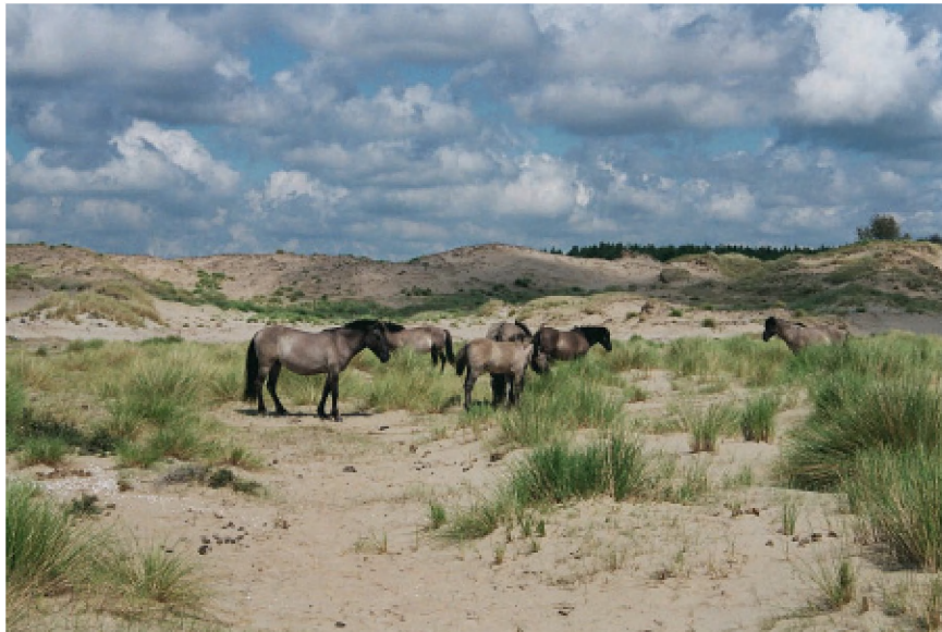
Fig. 4. 'Verlaten Veld' in summer 2004.