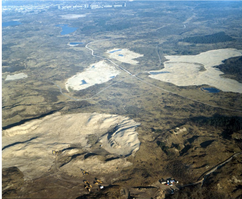
Fig. 5. Work being done in the 'Bride of Harlem'.

A second parabolic dune was remobilized winter 2002/2003. This experimental area is located north of the Verlaten Veld, about 1km from the North Sea, west of Lake Vogelmeer. It was part of a larger project where topsoil was removed from 30ha dune slacks formerly used for agricultural purposes. Sand was used for landscape restoration: filling up an old water extraction canal and improving an artificial dune lake (islands, shallow parts, dune slack). To avoid causing disturbance to visitors by sand-transporting trucks, hydraulic sand transport was used.