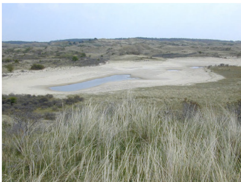
Fig. 2. Project Wurmenveld, Zandvoort, 24-04-2002; former potato fields transformed into wet dune slack.