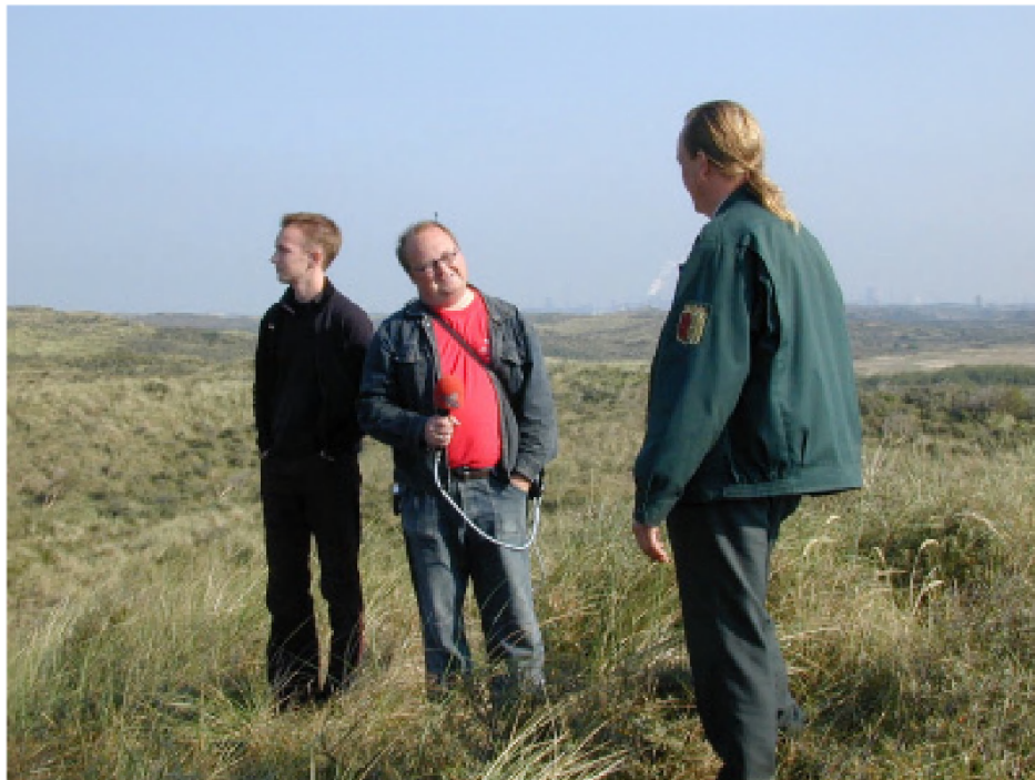
Fig. 6. Radio Noord-Holland.

In the future we hope to remobilize an entire landscape consisting of the frontal dune ridge and two series of parabolic dunes. Here we hope to achieve that landscape-forming processes remain active for a very long time (decades).