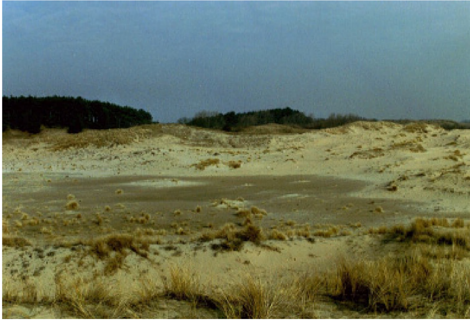
Fig. 7. 'Verlaten Veld' March 2003.