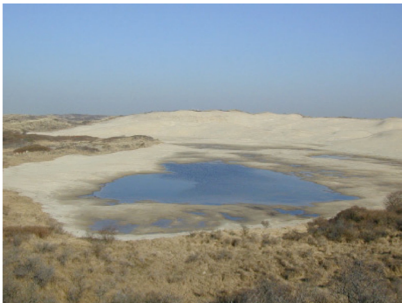
Fig. 1. 'Bride of Harlem', reactivated dune in February 2003.